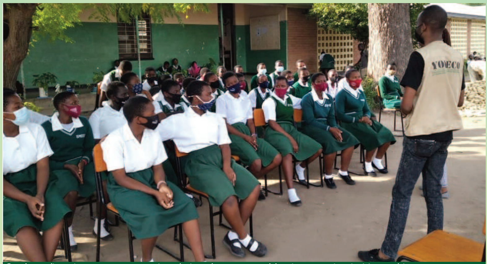
Students listening to a presentation during the menstrual hygiene session in Mangochi.

Our team in Mangochi district had a menstrual hygiene session with adolescent girls at St Monica Girls Secondary School.