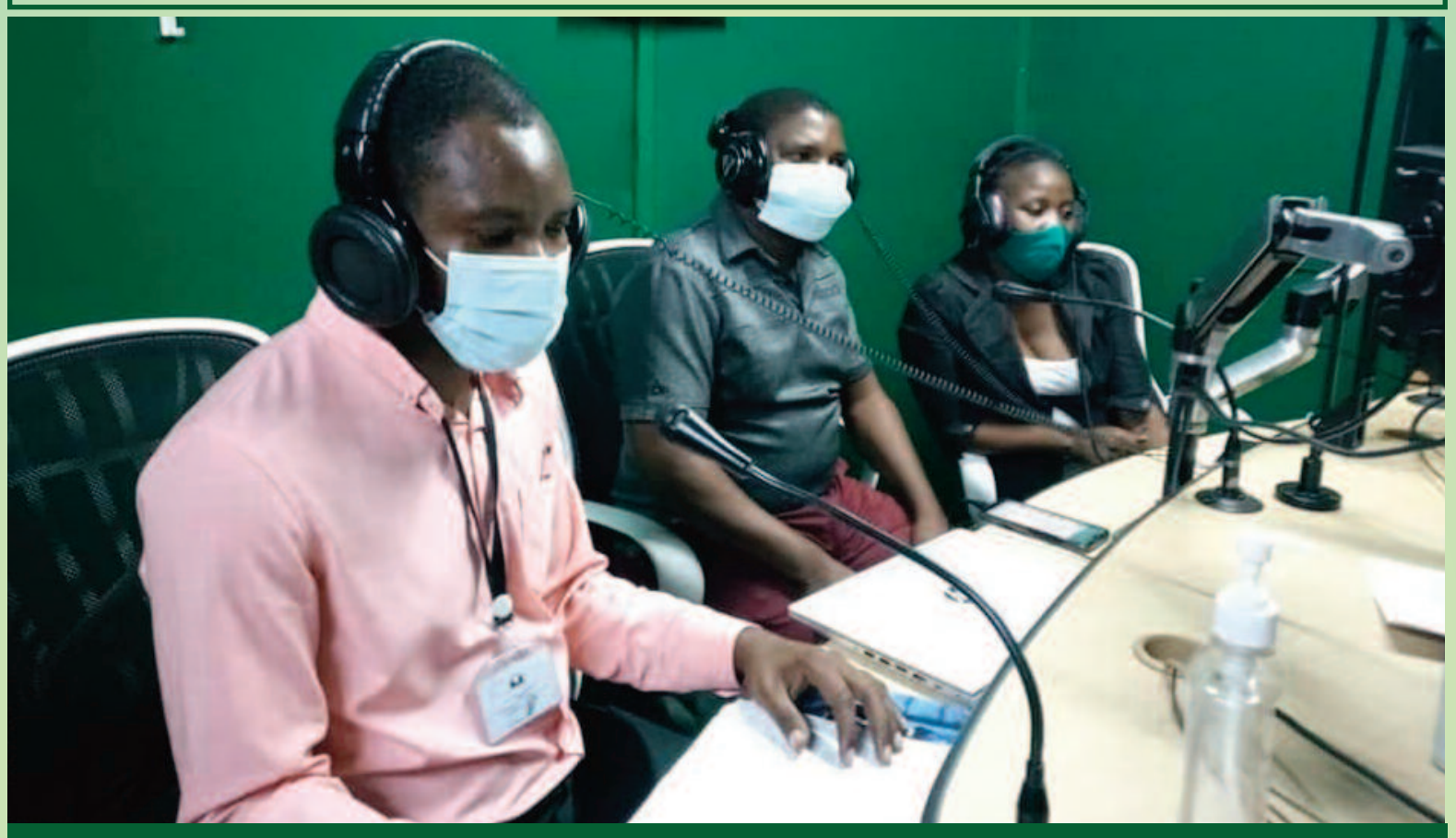
Panelists during the live discussion in YFM studios.

Zomba stakeholders launched the commemoration for International Day for Street Connected Children 2021, through a live panel discussion on YFM.