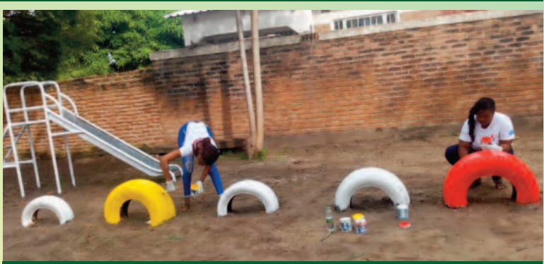
YONECO staff painting the playing materials.

As YONECO, we are also very grateful to the Officer-In-Charge for Mangochi Police Station who has donated used tires which have been painted and are part of the children's recreational materials.