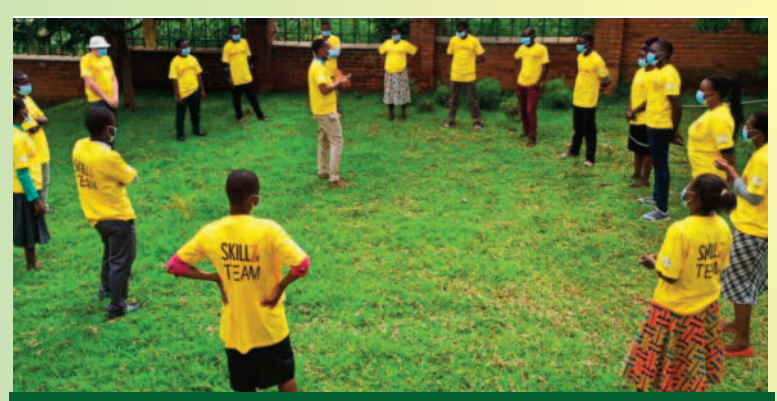
SKILLZ Community Coaches during the training.

In an effort to strengthen Gender-Based Violence (GBV) prevention and postviolence care services, YONECO has trained 20 Community Coaches on how to deliver evidence based SKILLZ HIV and GBV primary prevention curriculum to OVCS around Traditional Authorities Mlumbe, Malemia, Kuntimanji, Chikowi, and Mwambo in Zomba District.