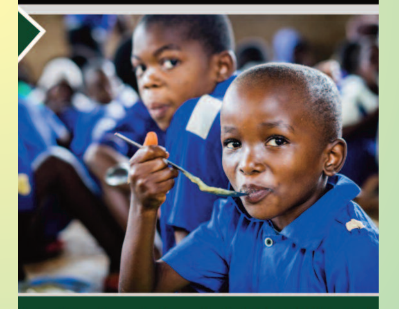
Kuzembetsa ufa wa phala pa sukulu ndi mlandu. Ndi udindo wa aliyense kuonetsetsa kuti ufawu ukugwira ntchito yake yoyenera.

Nenezani aliyense ozembetsa ufa wa phala wa pa sukulu poimba foni mwaulere pa 116, 5600 komanso 5800