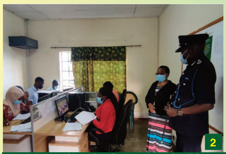
Appreciating the Tithandizane National Helpline