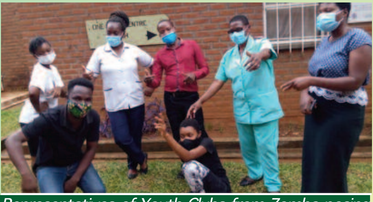
Representatives of Youth Clubs from Zomba posing for a photo after the meeting.

Young people around Zomba City have been encouraged to keep on accessing Sexual Reproductive Health services (SRH) amid the Covid-19 Pandemic to protect themselves from Sexually Transmitted Infections (STIs) and early pregnancies.