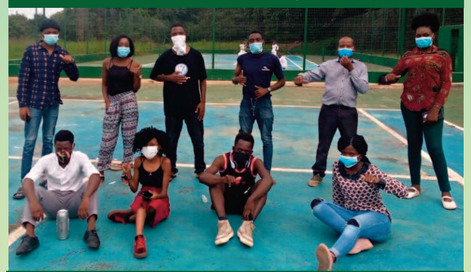
Goal for Life Youth Club members posing for a photo after the meeting at Chancellor College in Zomba.

Goal for Life youth club in Zomba has said it is geared to improve the welfare of the youth around Zomba City with various interventions that will help them to become productive citizens.