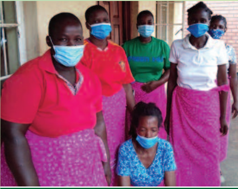
Some of the Members of Namalaka VSLA.

Women from Namalaka Village Traditional Authority (T/A) Chikowi in Zomba district have started reaping the fruits of being members of a Village Savings and Loans Associations (VSLA) initiative that was introduced by YONECO in 2018.