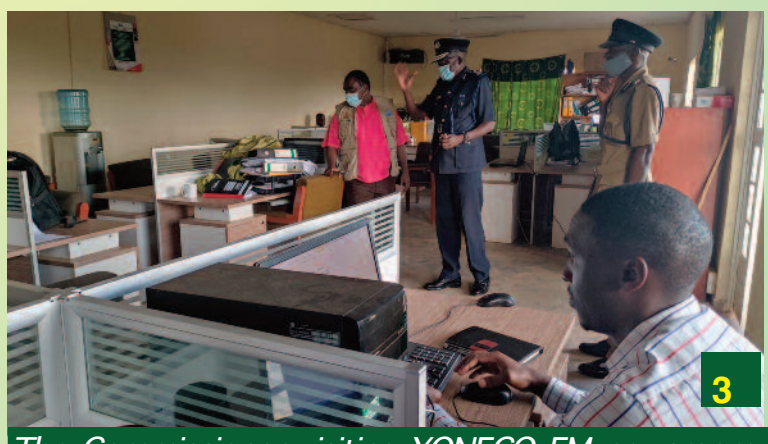
The Commissioner visiting YONECO FM newsroom