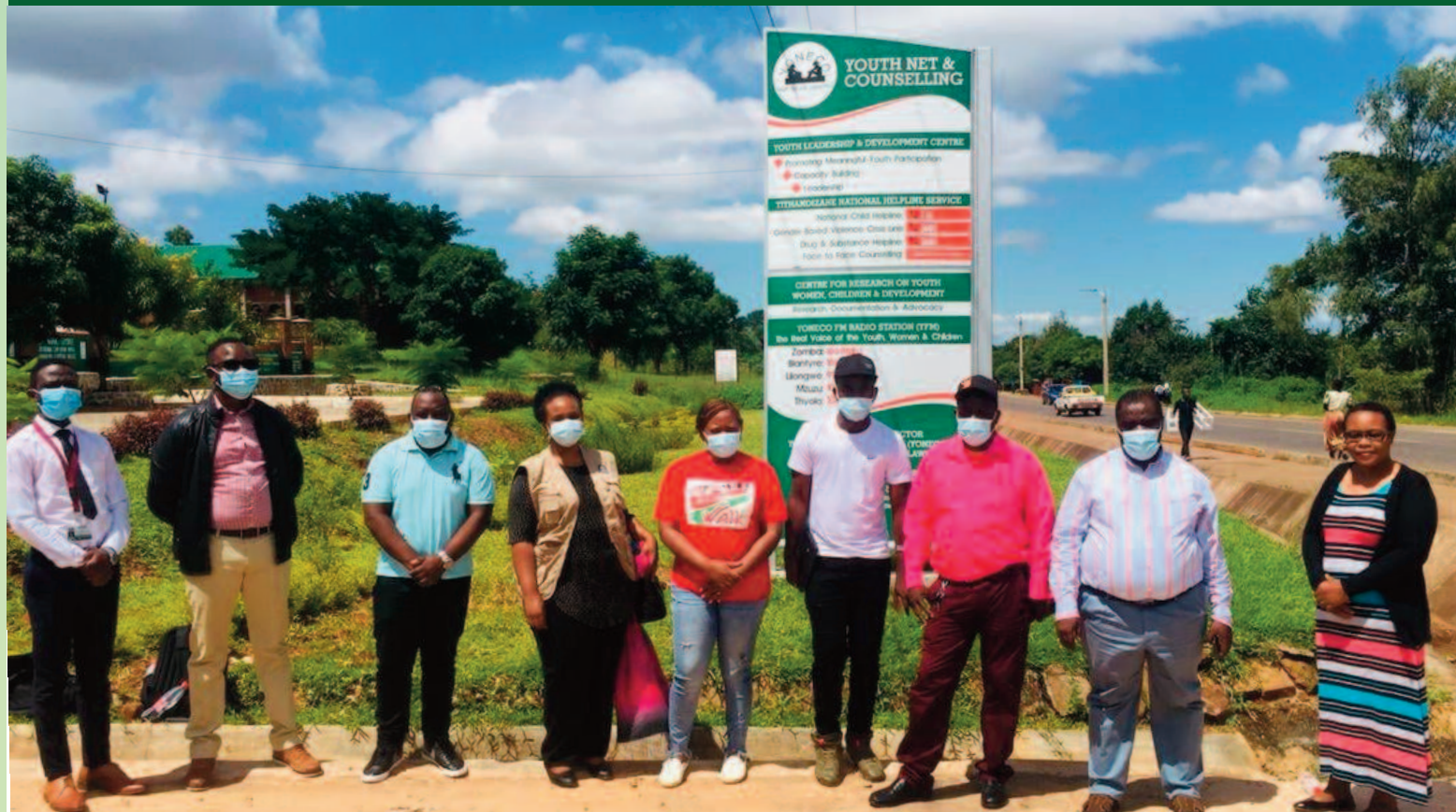
NAC officials posing for a photo with YONECO members of staff outside it's head office.

Officials from the National AIDS Commission (NAC) had an engagement meeting with YONECO management team in Zomba as one way of enhancing coordination between the two institutions in the fight against HIV and other related issues.