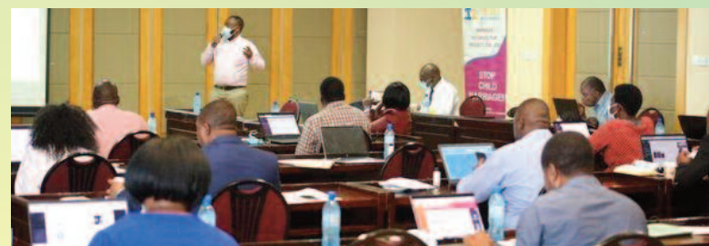
2 Recap session presentation.