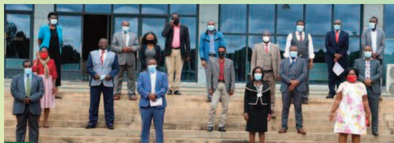
1 Participants posing for a group photo.

Rights Alliance, NGO Gender Coordination Network - Malawi, Malawi Human Rights Resource Centre, HRCC-Human Rights Consultative Committee as well as officials from the Ministry of Gender, Community Development and Social Welfare.