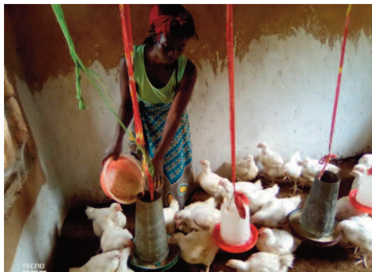
Some of the chickens that the clubs are raising

Manje and Vilemba Youth Clubs ventured into poultry farming after the training that was held late last year. Currently, the members of the two clubs