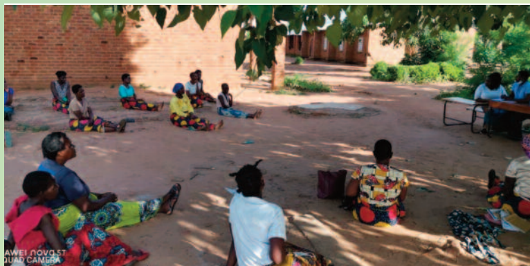
Women during the meeting in Balaka.

YONECO has facilitated the establishment of five Village Savings and Loans Associations (VSLA) for women in the area of Traditional Authority (T/A) Nsamala in Balaka district.