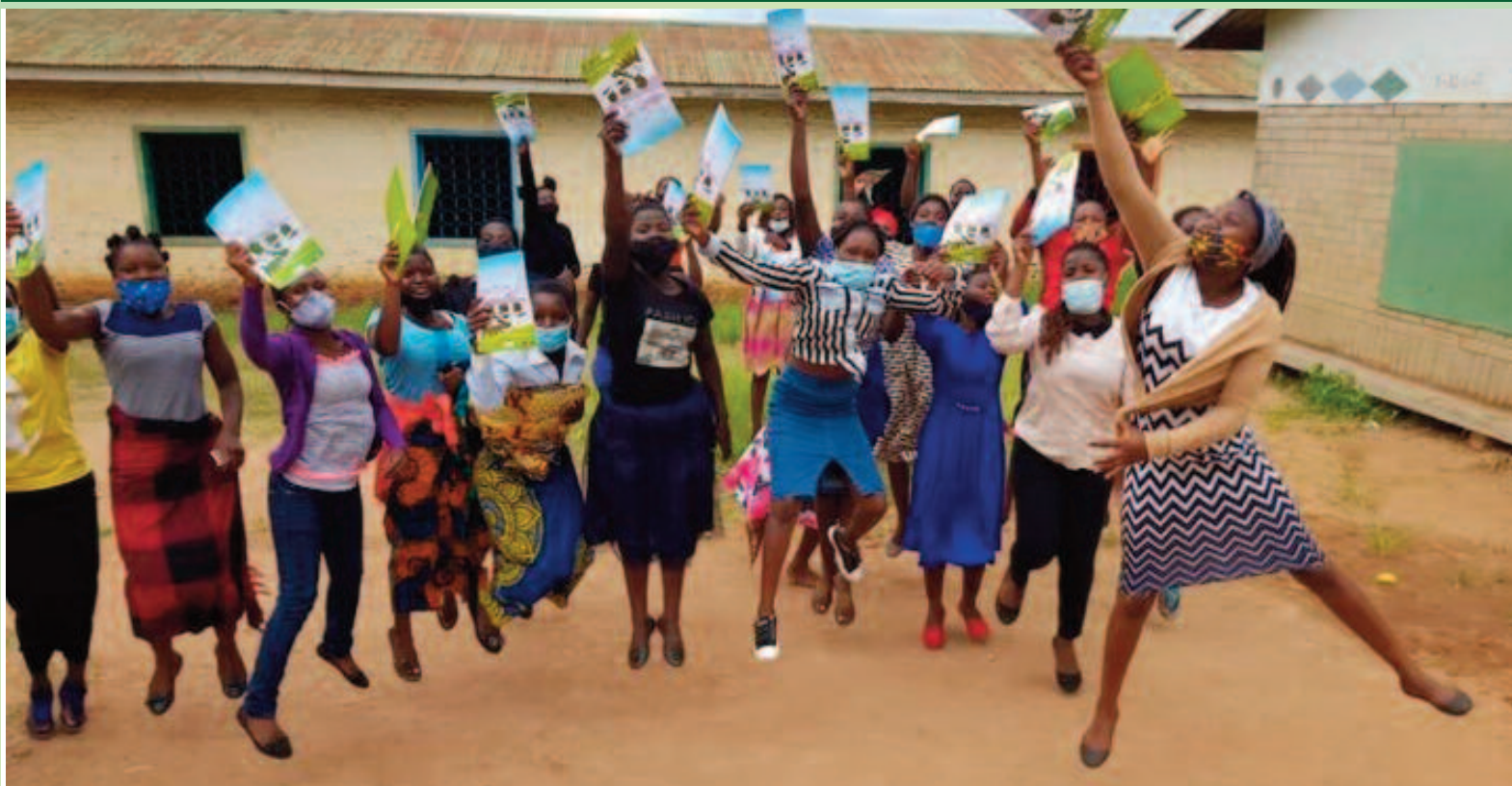
A group of participants celebrating after the training in Blantyre

20 adolescent girls from South Lunzu in Blantyre district have been trained to facilitate sessions on child rights and responsibilities as well as management of financial resources.