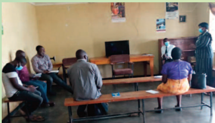
NGO members during the meeting.

Members from various Non-Governmental Organizations (NGO) that are operating in Ntcheu have entrusted YONECO to take over leadership of the district's Civil Society Organization