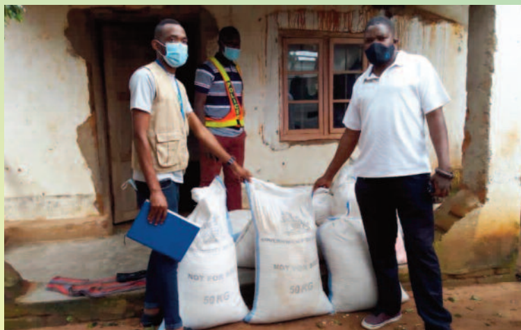
Bags of maize that were returned.

There are times when humanitarian support falls into the wrong hands of people who try to take advantage of the vulnerable by taking what does not belong to them. Heartrendingly, some people who do this are traditional leaders who are expected to serve their subjects.