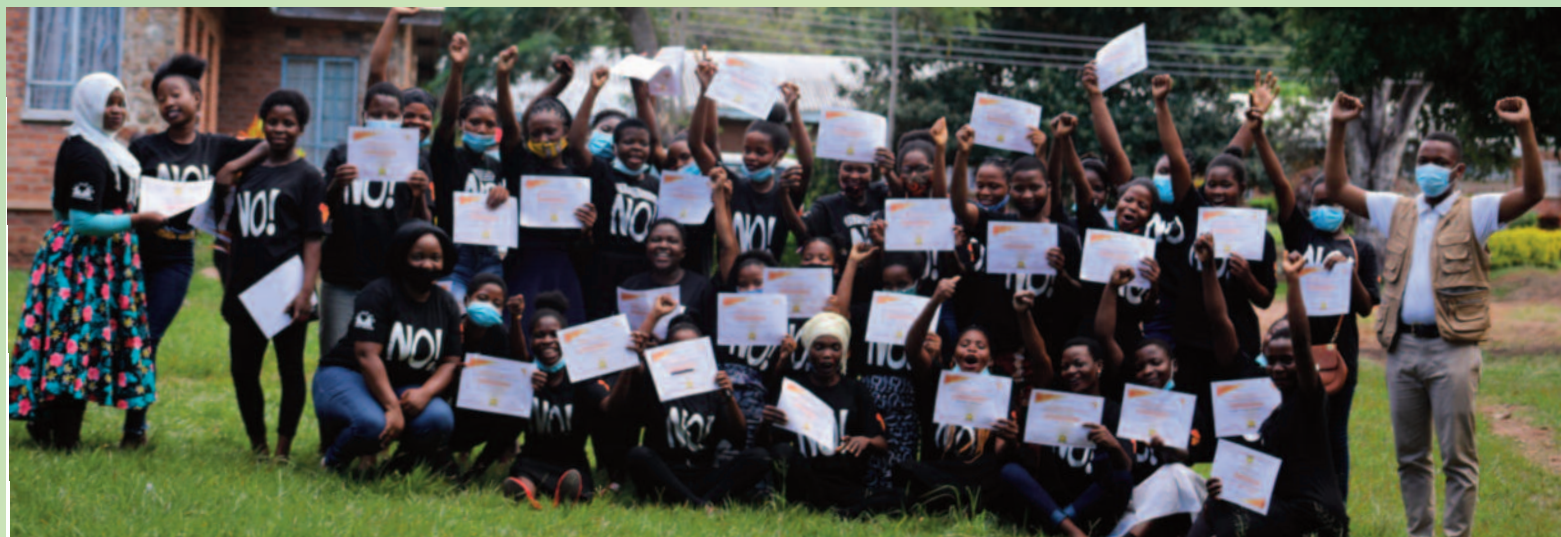
Graduates posing for a photo showcasing their certificates.

A total of 33 girls from various parts of Zomba district have graduated as Impower facilitators after an intensive three-weeks training program in self-defense against various forms of sexual abuse.