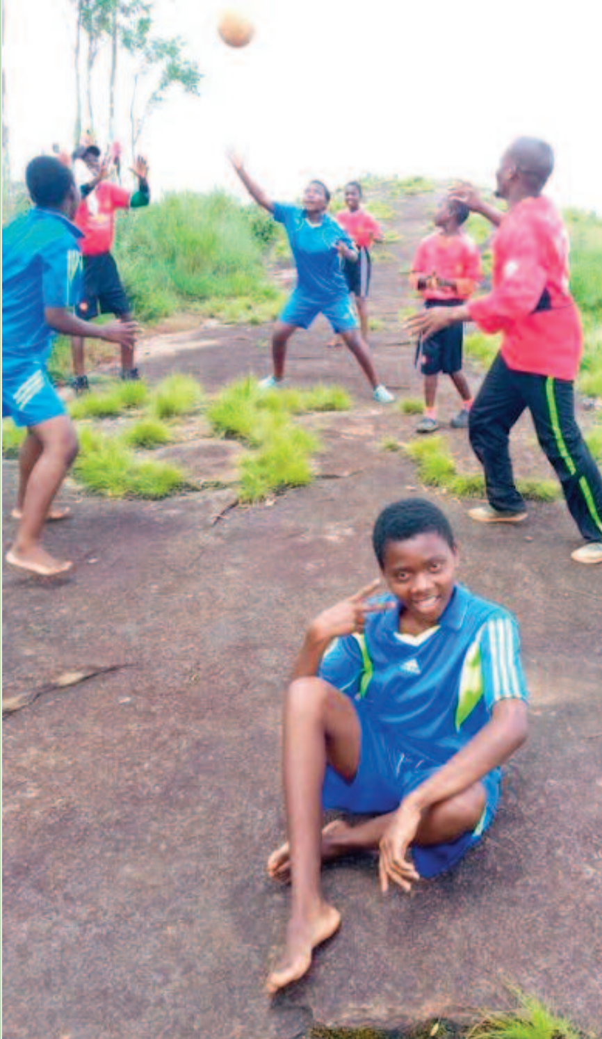
A netball session in the area in Zomba district

YONECO has intensified the use of sports to promote social change among adolescent boys and girls in a number of communities across the country.