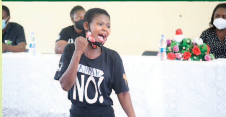
Showcasing what they have learnt.