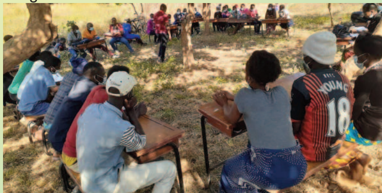
A community meeting on GBV in progress

About 30 community members attended the session which was spiced up by drama as well as traditional songs and dances.