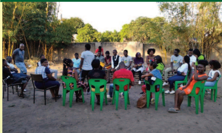
Mangochi Youth engaged in dialogue on SRHR