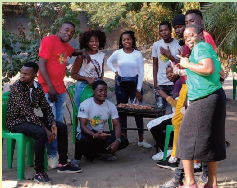
Mangochi Youth and YONECO District Manager (R)

Currently, YONECO has Youth Drop-in-Centres in Nkhata Bay, Rumphi, Mchinji, Lilongwe, Ntcheu, Balaka, Mangochi, Machinga, Zomba and Blantyre districts. The DICs operate as information hubs for young people on SRHR, alcohol and substance abuse.