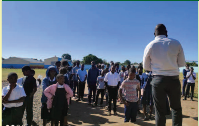
An SRGBV awareness session with secondary school students