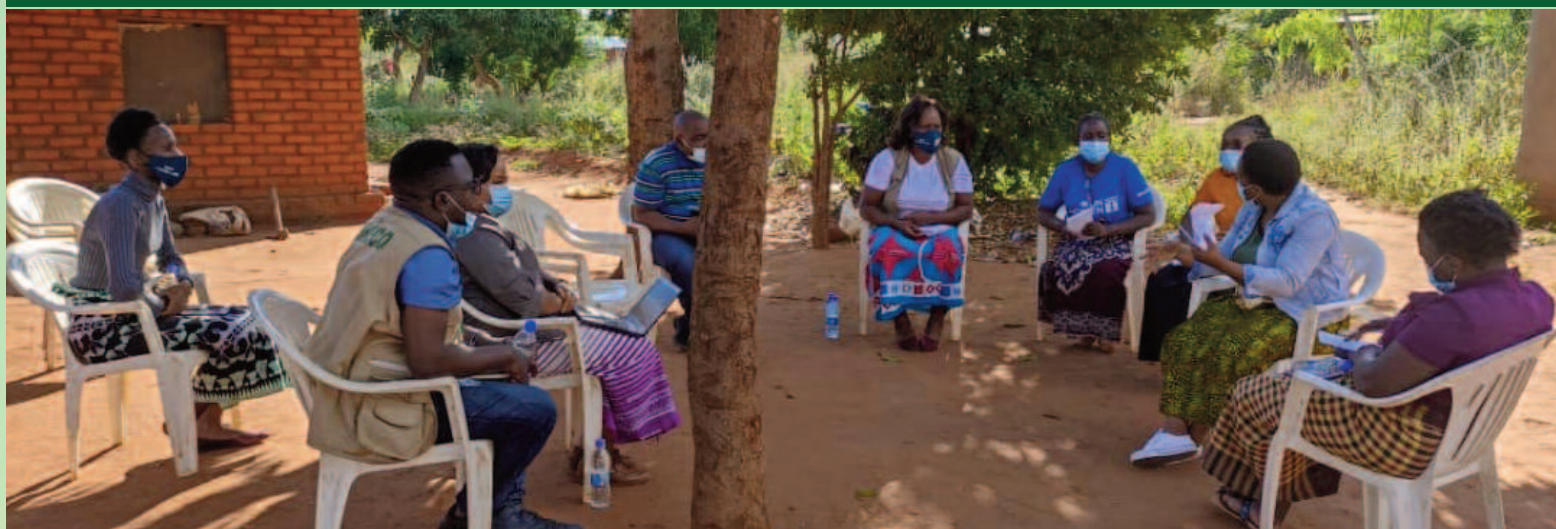
UN Women and YONECO staff in an engagement meeting at Nkula in machinga district

UN Women conducted a monitoring visit in Paramount Chief Kawingain Machinga district to appreciate progress of interventions done under the Spotlight initiative Project.