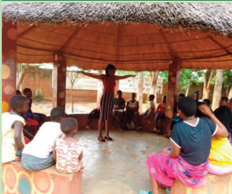
A WASH session in progress

YONECO has introduced Water, Sanitation and Hygiene (WASH) sessions for young people in Balaka district.