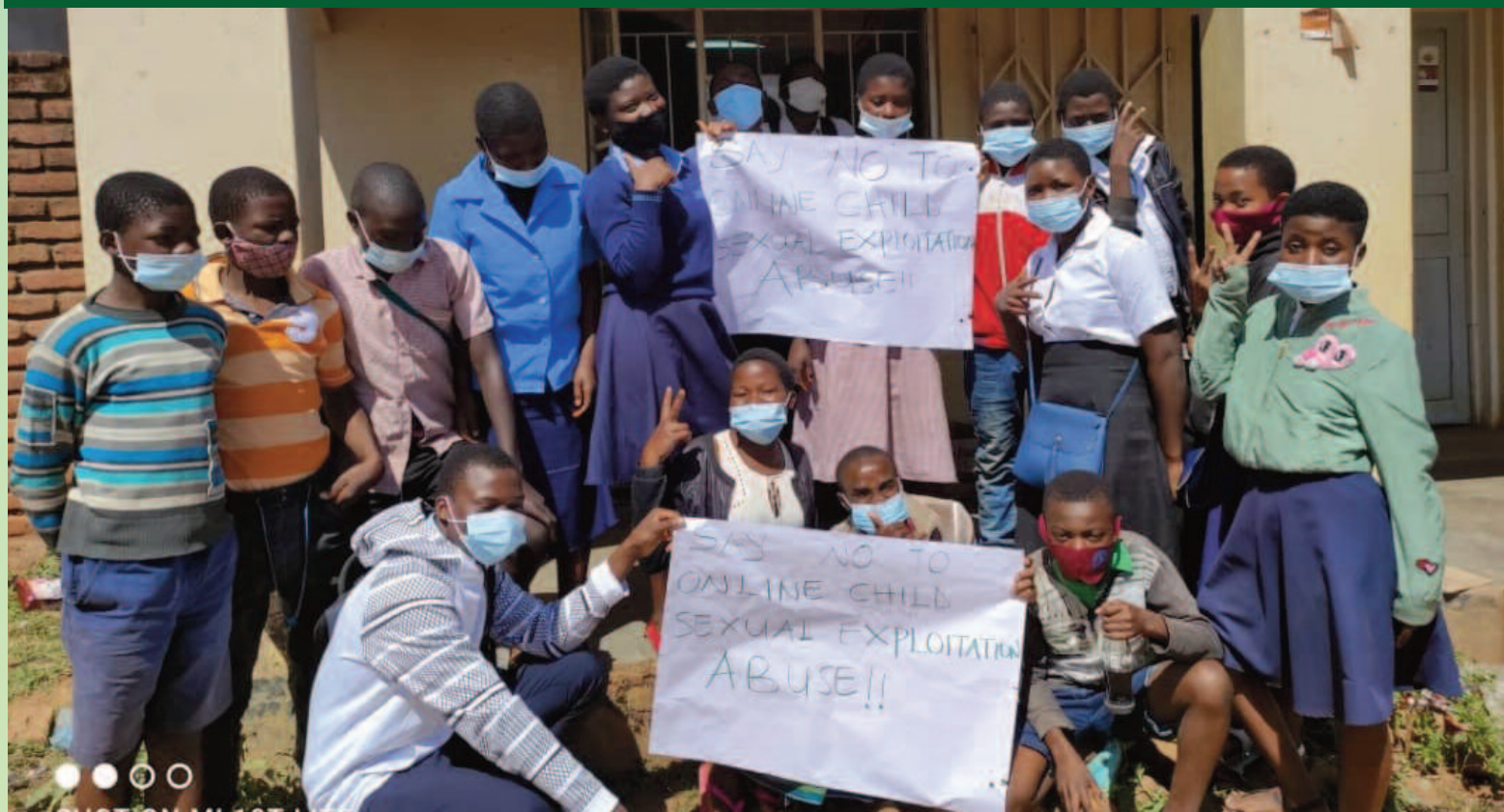
School Champions after their initial training at YONECO Youth Drop-In-Centre in Ntcheu

YONECO, Ntcheu Office, has trained School Champions under a newly introduced project which is being funded by Trocaire and it is aimed at ending Online Child Sexual Exploitation and Abuse (OCSEA).