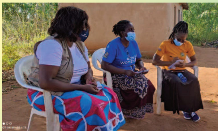
A dialogue session at community level in Machinga district

The implementation of the project will run from March to June 2021.