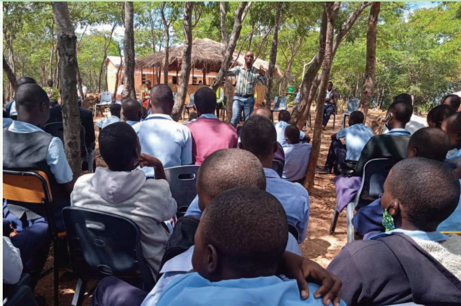
An SRGBV session at Lisale Community Day Secondary School

School authorities from Nkhata Bay district have commended YONECO for conducting awareness sessions on School-Related Gender Based Violence (SRGBV) in various primary and secondary schools in the district.