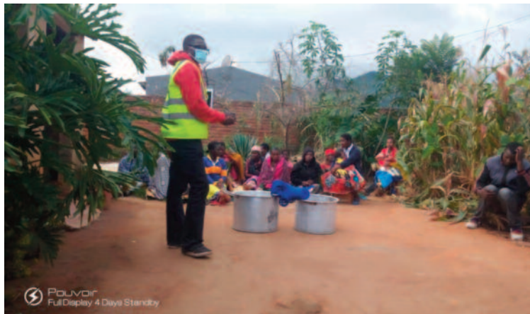
A community meeting on CFRM in progress in Dedza

Despite various interventions and sensitization meetings on the objectives of the Lean Season Response (LSR) Programme, Chiefs continue to be the biggest culprits in compromising the set standards by beating the system on the grounds of promoting citizen participation towards development activities.