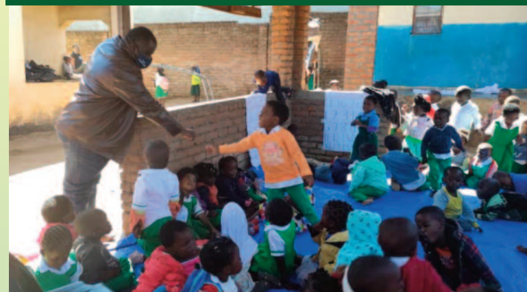
YONECO ED greeting a learner at YONECO ECD Centre in Ntcheu district