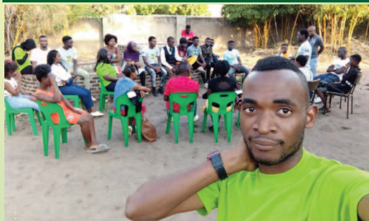
Young people from Mangochi outside YONECO DIC