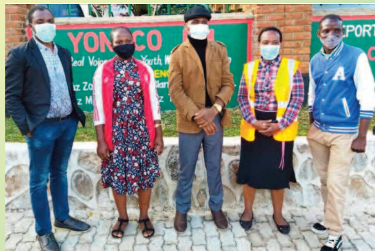
Members of Zinalikuti Youth Club and YONECO staff

The club was welcomed by seven youth clubs around Zomba City and the club had a chance to visit YONECO head office as well as participated in the production of some radio programs on YFM.