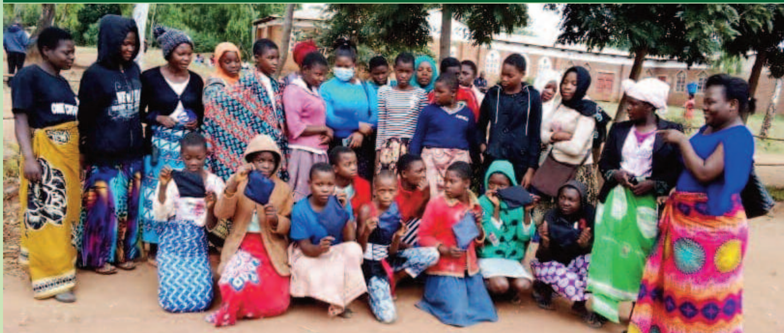
Participants carrying their hand-sewn sanitary pads

Sanitary pads are expensive and often inaccessible. Some girls resort to managing their periods with pieces of rags or paper which are often unhygienic and uncomfortable. Others ask for permission to leave school premises and many stay at home during their periods.