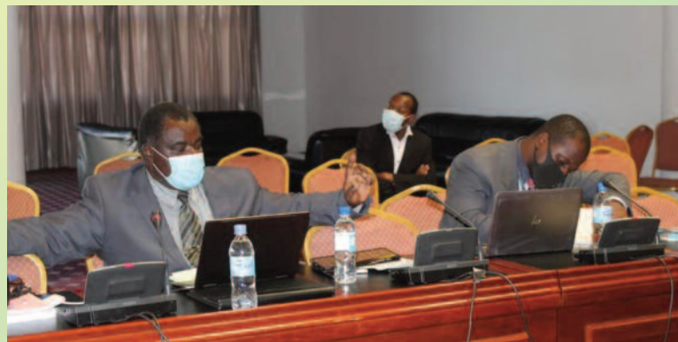
YONECO ED making a presentation at Parliamentary

Lastly, the committee requested YONECO to open up more district offices across the country. Currently, YONECO has 15 district offices across Malawi with additional adjunct offices in eight districts.