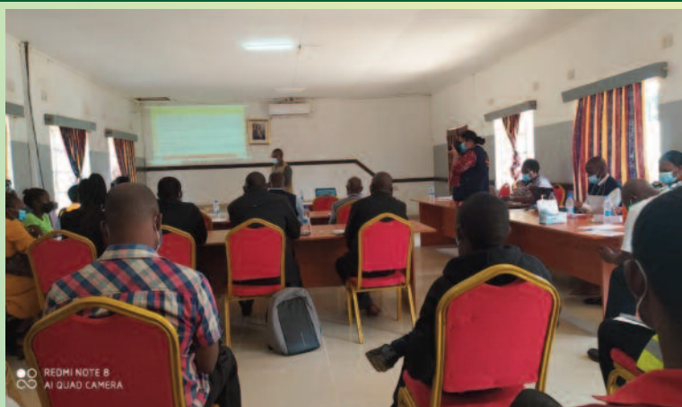
Stakeholders' meeting in Nkhata Bay

YONECO attended a stakeholders' meeting in Nkhata Bay district for UNFPA-funded Spotlight Initiative Safeguard Young People (SYP) Malawi.