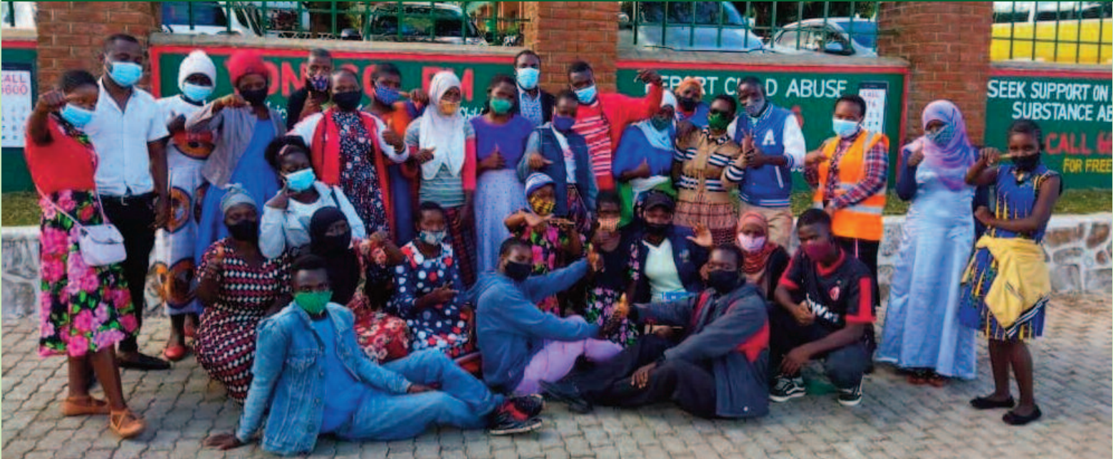
Members of Zinalikuti Youth Club at YONECO Head Office in Zomba

Zinalikuti Youth Club from Chiradzulu District visited Mapale Drop-in Center (DIC) to interact with youth clubs around Zomba City.