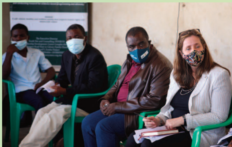
Trocaire Country Director (R) and YONECO ED (in brown)

YONECO conducted a monitoring visit in Ntcheu district to appreciate the implementation progress of the Responding to Online Child Sexual Exploitation and Abuse project.