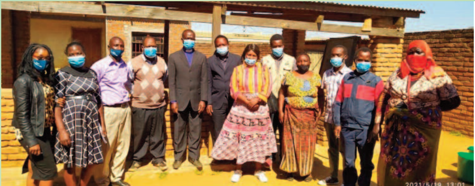
Members of Ntcheu District Interfaith AIDS Committee (DIAC)

Religious leaders under the banner District Interfaith AIDS Committee (DIAC) in Ntcheu district have hailed YONECO's interventions in child protection.