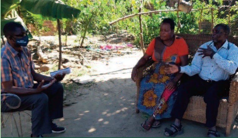
Community members during the CFRM meeting.

In ensuring that WFP programmes are credible and abuse-free, YONECO toll free lines are being used as a key reporting mechanism in humanitarian response amidst the Covid-19.