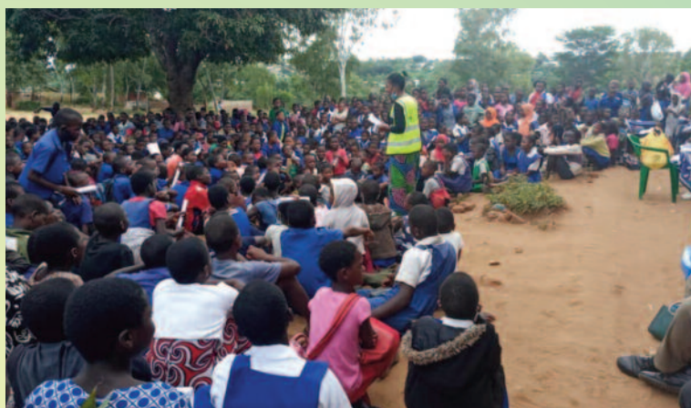
Students during an SRHR awareness session

The sessions are being conducted with financial and technical support from UNFPA through Spotlight Initiative.