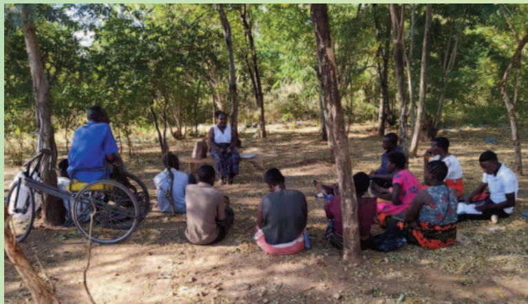
Women's meeting on GBV in T/A Zulu's area in Mchinji

Gender Based Violence (GBV) is one of the vices that will negatively impact on efforts that are being made towards the attainment of SDG 5 and other equally important sustainable development goals if it is left unchecked.