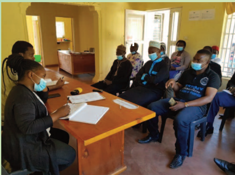
An OCSEA session in progress at YONECO district Office in Balaka

the dangers of online child sexual exploitation and the available reporting mechanisms.