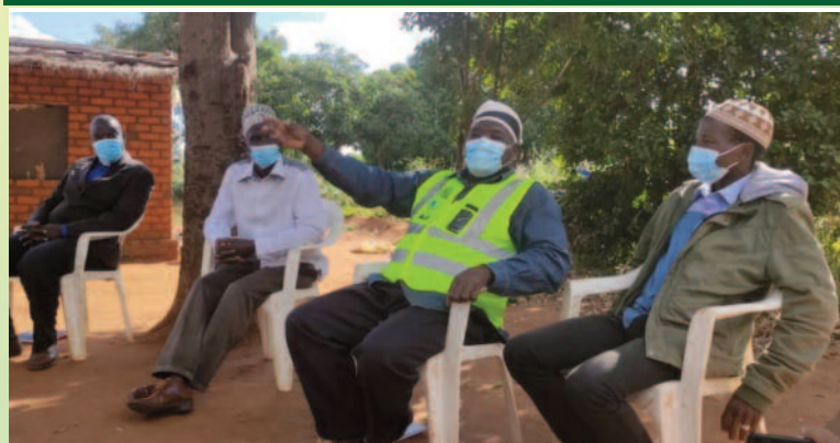
Community leaders engaged in a dialogue session