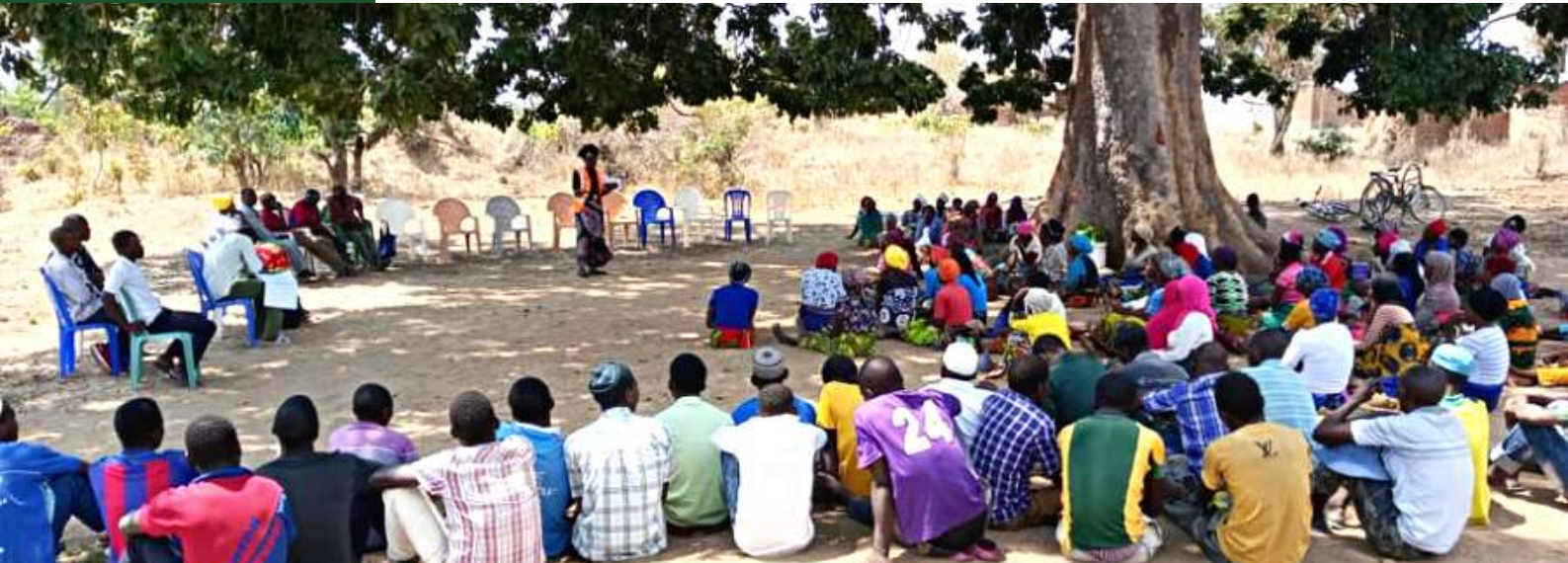
Insert: YONECO officers engaging with community members who attended the legal awareness session

On 17 September 2022, YONECO conducted a community legal awareness session at Issa Mponda Village in the area of Traditional Authority (T/A) Mponda in Mangochi district.