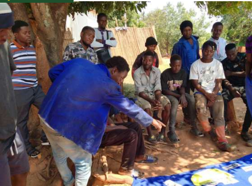
Insert: Young people interacting with the Hope Kit Tool during the HIV/AIDS session

On 9 September 2022, YONECO organized an HIV/AIDS session with young people from Mng'ona and Mtilirwa villages in the area of Traditional Authority (T/A) Mkumbira in Nkhata Bay district.