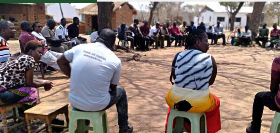
Insert: Community stakeholders who took part in the meeting in Balaka district.

The economic prospects that are being projected with the advent of mining activities in Balaka district are being marred by child labour practices that have seen over 400 learners dropping out of school to join the industry between 2019 and 2022.