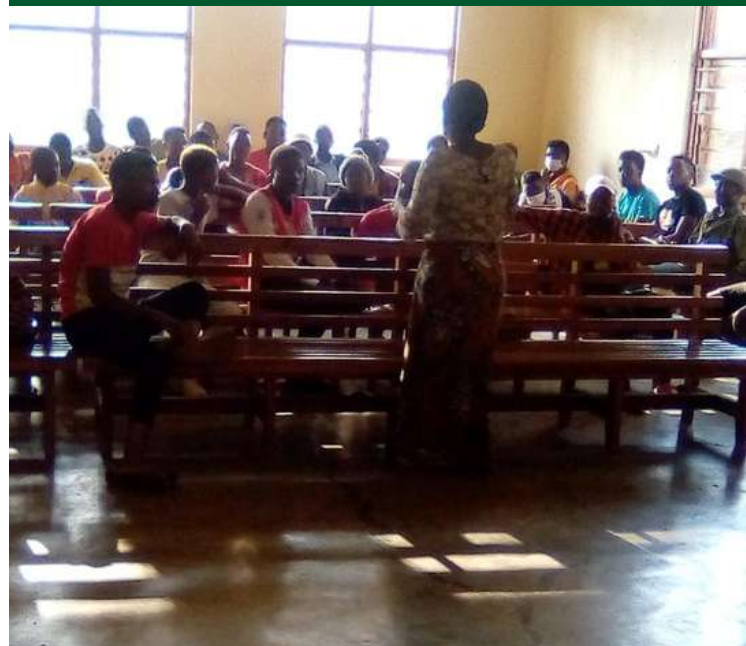
Insert: Some of the youths during the session at Zomba Youth Friendly Health Service Corner

The session was attended by a group 40 young people (20 males and 20 females).