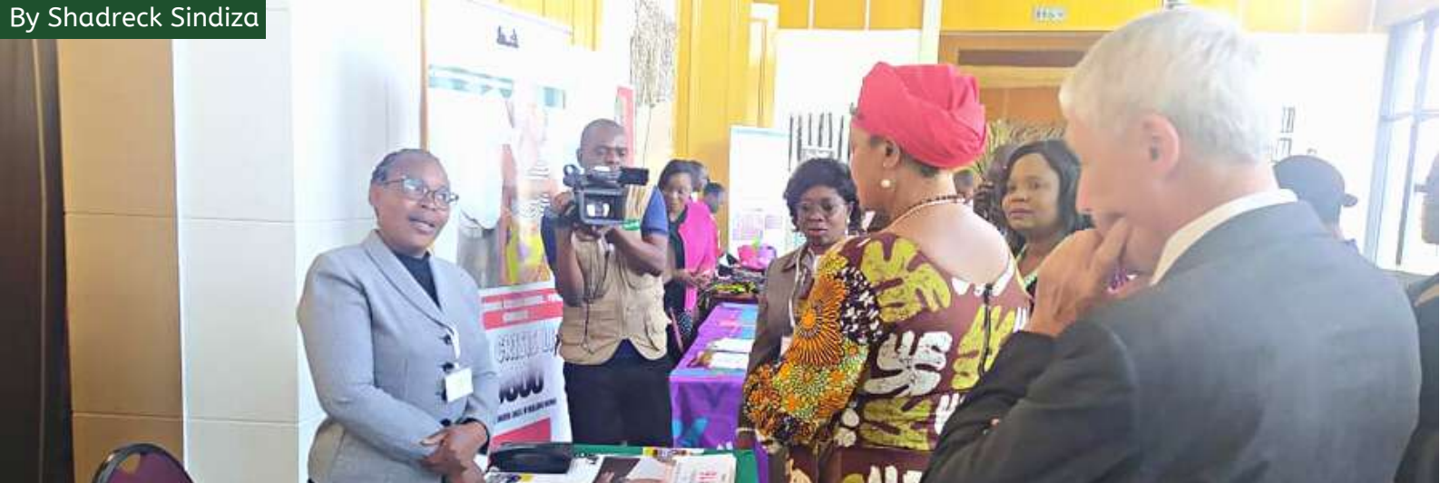
Insert: Minister of Gender, Community Development and Social Welfare Hon. Dr. Patricia Kaliati visiting YONECO pavilion that was mounted to showcase some of the interventions the organisation is currently doing.

YONECO participated in this year's National Gender Based Violence (GBV) Research Dissemination Conference which was held at Bingu International Convention Centre (BICC) in Lilongwe on 5 September, 2022.