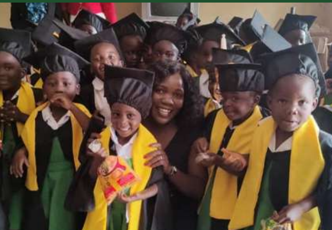
Insert: Some of the learners who graduated from Ntcheu ECD centre.

A total of 48 learners have graduated from YONECO Early Childhood Development (ECD) Centre in Ntcheu to start Standard 1 of their primary school education in the district.