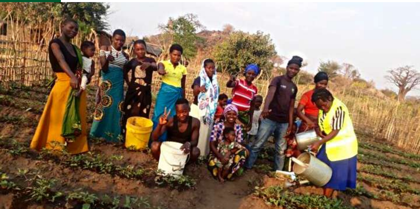
Insert: One of the beneficiary groups that was visited during the follow-up meeting.

Community members from Fowo Village, Traditional Authority (T/A) Namavi in Mangochi district have acknowledged the positive impact which livelihood activities have had on reduction of child marriage incidences in the area.