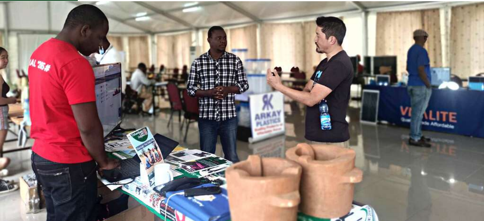
Insert: YONECO staff attending to one of the participant who visited the pavilion

YONECO joined various partners and stakeholders at Chawe Inn on Zomba Plateau where Treeze and other institutions organized a marathon dubbed 'Run 4 Reforestation' on 10 September 2022.