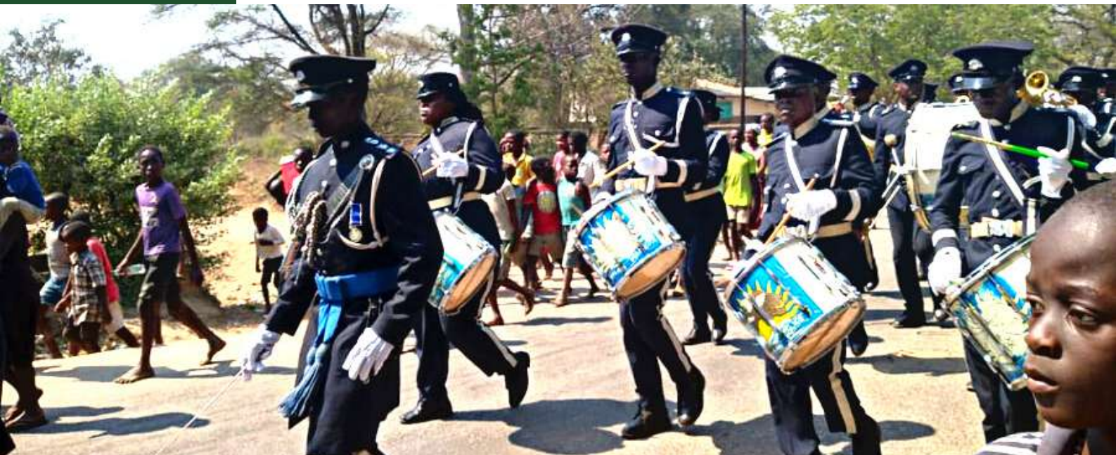
Insert: Police Brass Band performing during the National Public Awareness in Chikwawa

YONECO participated in the 2022 National Public Awareness on the Existence and Roles of Victim Support Units (VSUs) event that was held on 20 September at Chikwawa Community Ground.