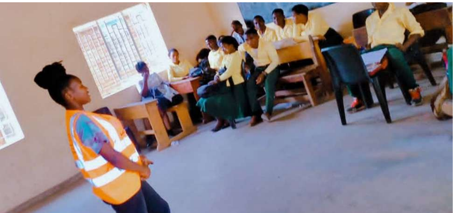
Insert: YONECO Officer engaging the students during the career guidance session

Career guidance sessions assist students to fulfil their dreams by helping them in making informed choices on what they want to become. The sessions help students to understand what it takes to accomplish their dreams at the same time give them a chance to seek advice on what they intend to do.