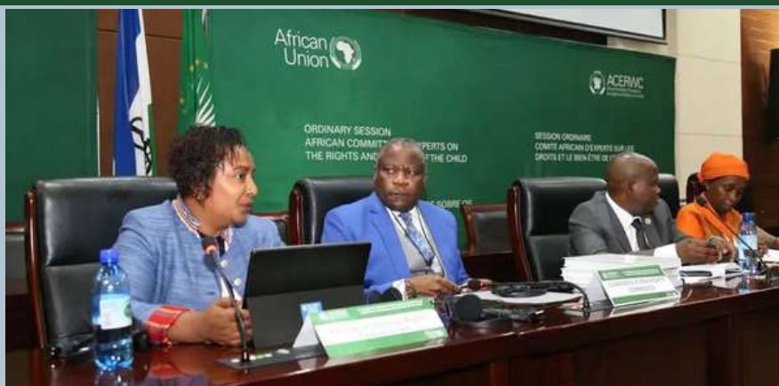
Insert: ACERWC panel during one of the sessions in Maseru, Lesotho.

YONECO is participating in the ongoing African Union 40th Ordinary Session of the African Committee of Experts on the Rights and Welfare of the Child (ACERWC) which is being held in Maseru, Lesotho.