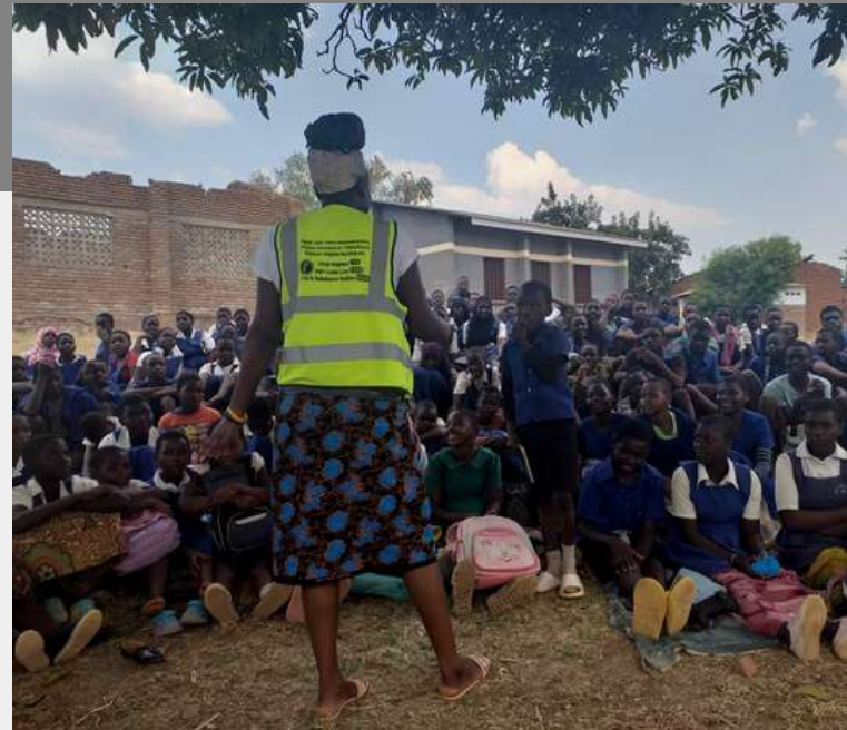
Insert: An officer from YONECO interacting with the learners during the SRH session

The session was aimed advising the learners on the negative impacts of early sexual debut and its effects, negative peer pressure and cultural beliefs. The learners were encouraged to protect themselves and to refrain from malpractices that they are exposed to on social media pages.