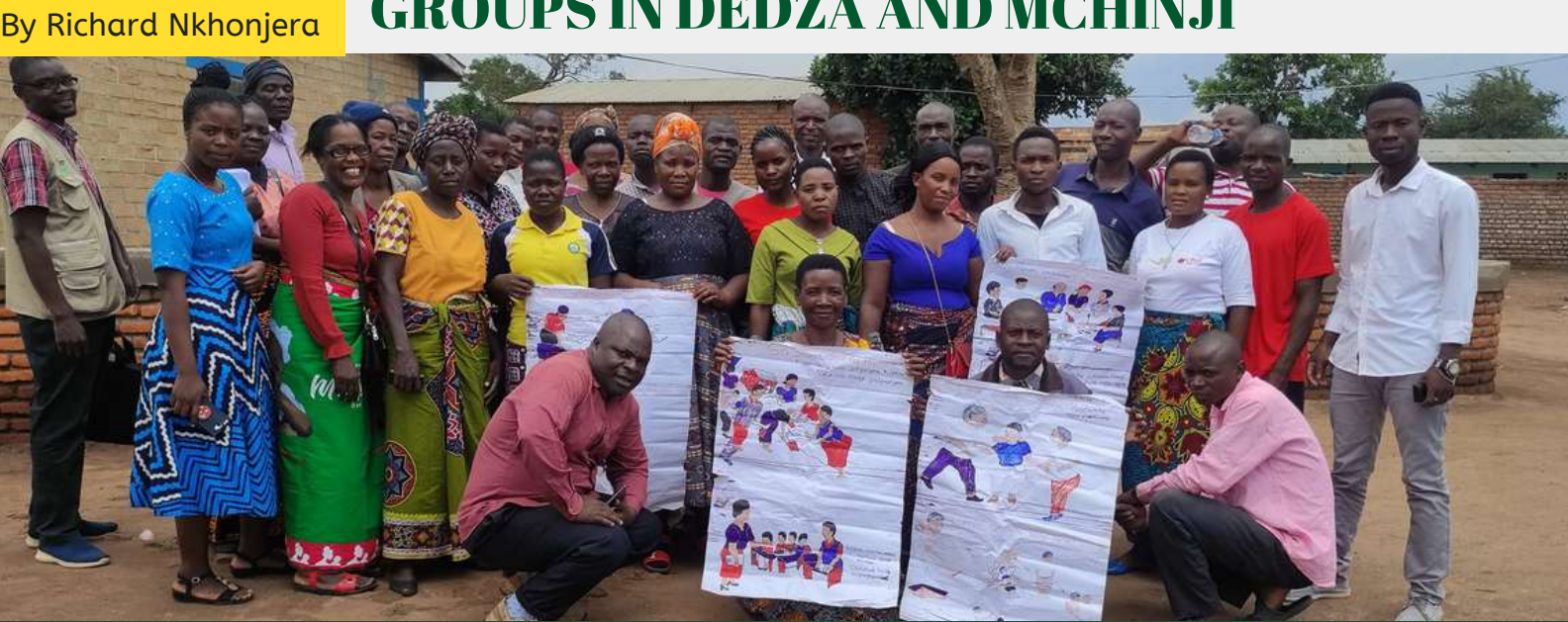
Insert: Members of various Mother Groups pose for a group photo together with facilitators after the training.

Mother Groups are community-based structures that promote girl child education by helping girls to remain in school and complete their education as well as providing age-appropriate Sexual and Reproductive Health (SRH) information.