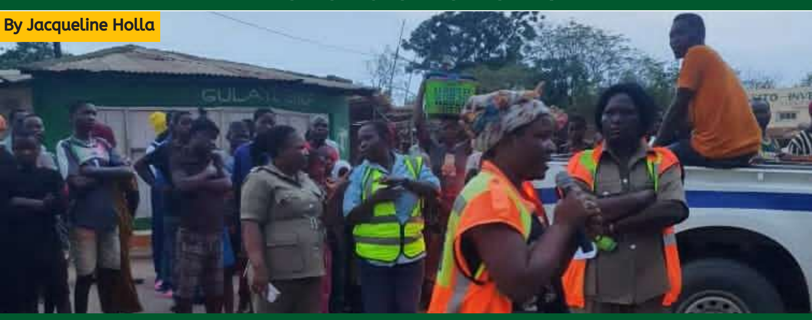
Insert: Police officers interacting with the community in this file photo

priority other key Among YONECO is committed to promoting rights violations in Malawi. 1 in 5 good health and human specifically for youth, women and sexual violence in their life time and children. In a YONECO mandate. uses strategies to promote the rights and (<a href="https://blogs.worldbank.org/nasikiliza">https://blogs.worldbank.org/nasikiliza</a> welfare of all people in the society <u>/tackling-gender-based-violence-</u> especially the vulnerable groups.