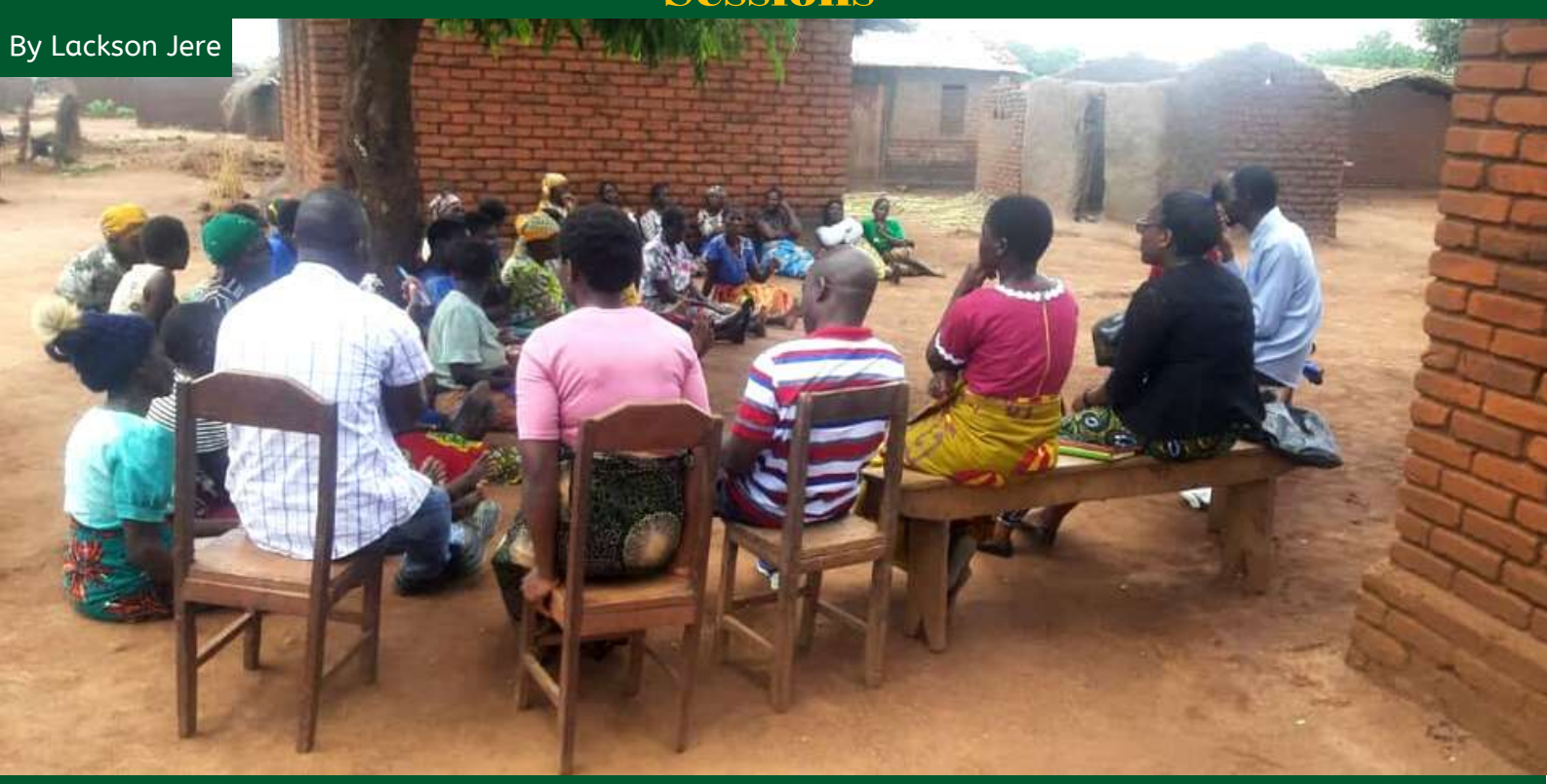
Insert: Participants being engaged in PCC during one of the sessions in Dedza District.