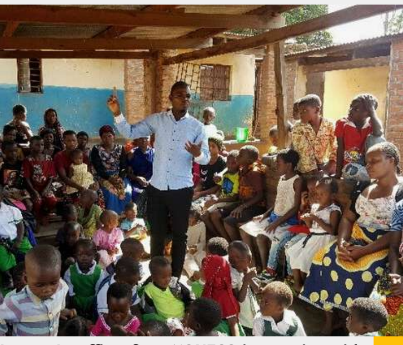
corporal the learners and guardians during the session.

15 December, 2022, YONECO conducted a child rights session with parents from the area Ntcheu district. The main objective of the session was to create an environment that fosters child growth and protection.