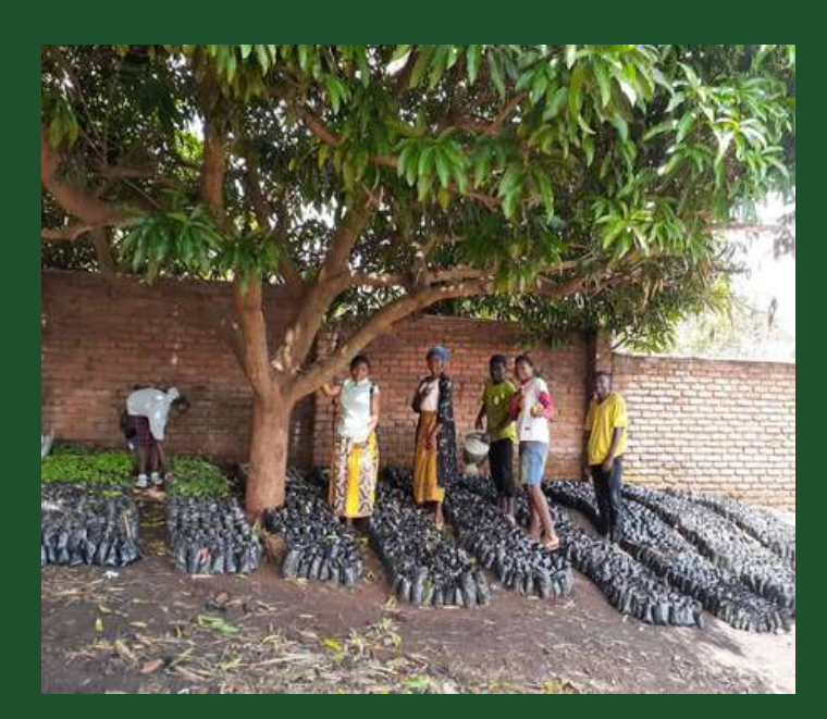
Insert: Some of the young boys and girls who are taking part in the establishment of a tree nursery in Zomba.

The group is being technically supported by YONECO in a bid to enhance young people's agency towards addressing issues of climate change and environmental degradation.