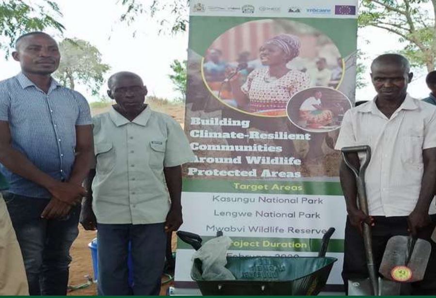
due to climate crisis. The activities are Insert: Some of the farmers who emerged winners in the competition

through As one way of motivating local farmers to venture into YONECO launched two Diversified competitions in 2021 to award the best performing Women, communities and lead farmers in the project's impact Disabilities areas using an agreed criterion.