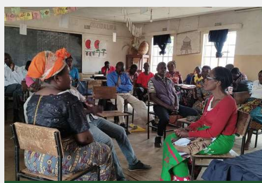
Insert: Mother Group members during the session

The trainings were conducted under Action for Teen Mothers and Adolescent Girls Project with support from UNFPA and KOICA.