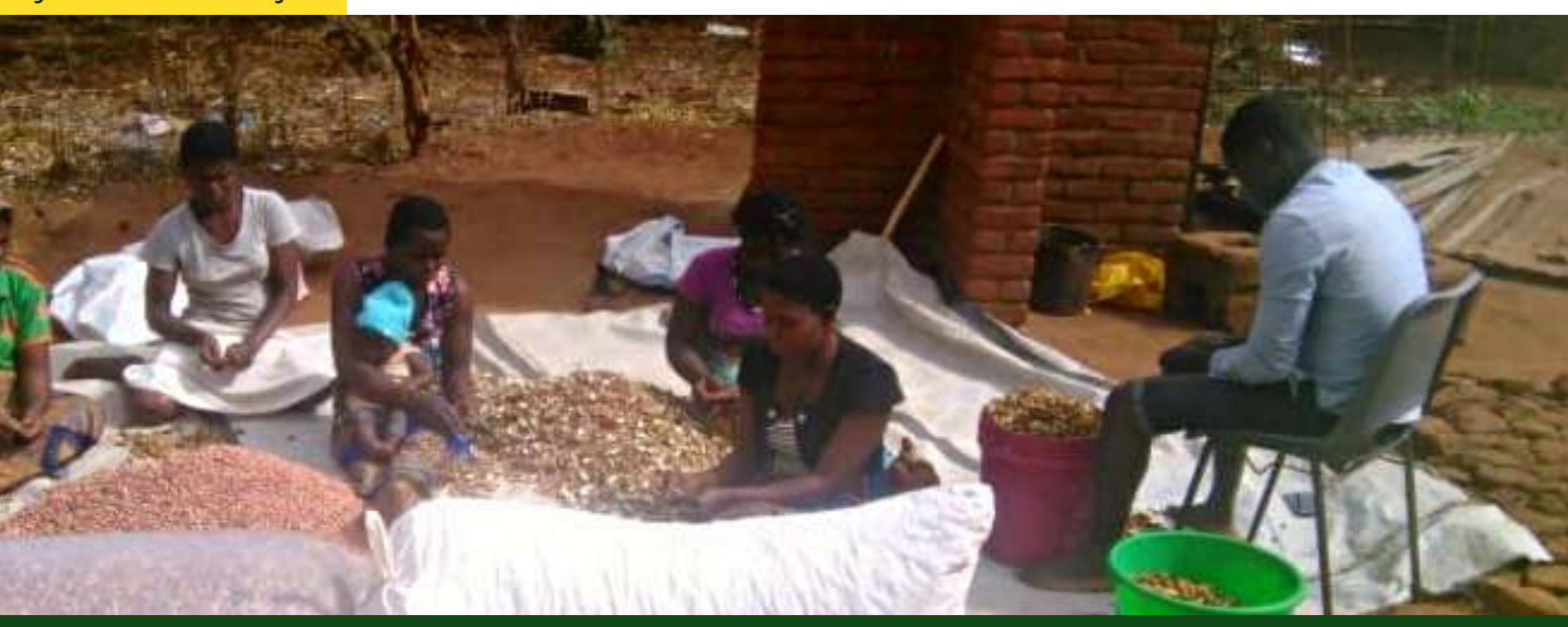
Insert: Some of the youth who are benefiting from the project in Ntcheu District

Malawi's greatest human resource to achieve sustainable socioeconomic growth lies in its youthful population. The 2018 Population and Housing Census that was conducted by the National Statistical Office (NSO) revealed that 51 percent of the country's population is under the age of 18. However, inaction to harness the potential which young people have is a threat to the promising future which the country has.