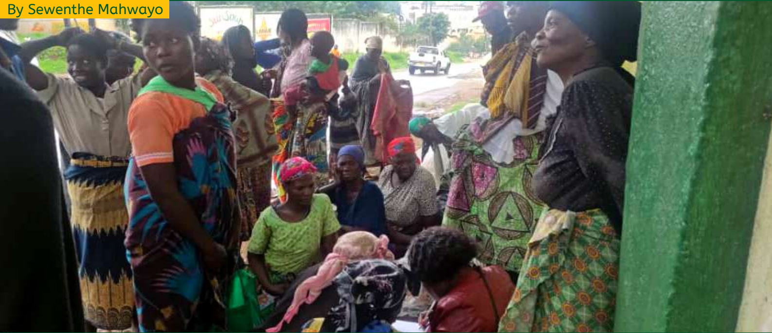
Insert: Women who were engaged during the session in Limbe, Blantyre.

YONECO recently held an engagement session with 30 women who earn a living through begging along the streets of Limbe town in Blantyre.