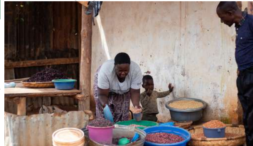
Insert: One of the beneficiaries of the women economic empowerment intervention.

It is against this background that YONECO conducted a visual documentation of some of the interventions that being are implemented in Zomba, Mangochi and Ntcheu. The visual documentation was done by an independent consultant who wanted to document some of the successes being registered and their impact.