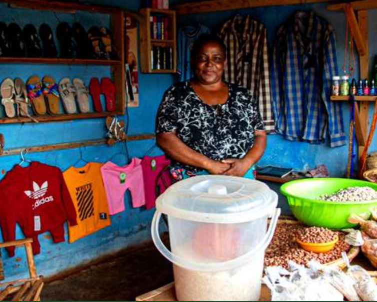
Insert: A woman beneficiary standing in her shop at Chinamwali Trading Centre in Zomba

Women's economic empowerment can have a positive impact on overall economic growth and development. When women are able to participate fully in the workforce, it increases the size and productivity of the workforce, which in turn can lead to higher levels of economic growth. Additionally, when women have control over their own income and assets, they are able to invest in their families and communities, which can lead to improved health, education, and overall well-being.