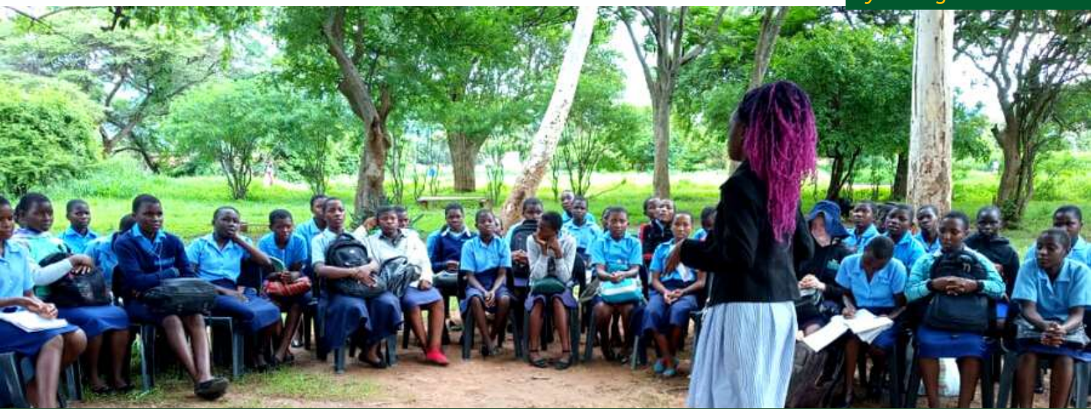
Insert: YONECO Field Officer for the district engaging with the students during the awareness session at Rumphi Secondary School in the district.

YONECO office in Rumphi district conducted an awareness session on sexual and school-related gender-based violence at Rumphi Secondary School. The district staff, along with other professionals, led the session and provided information on the reporting mechanisms that are available to students. The session was designed to inspire and motivate students, particularly the 55 Form 1 girls who attended the session.