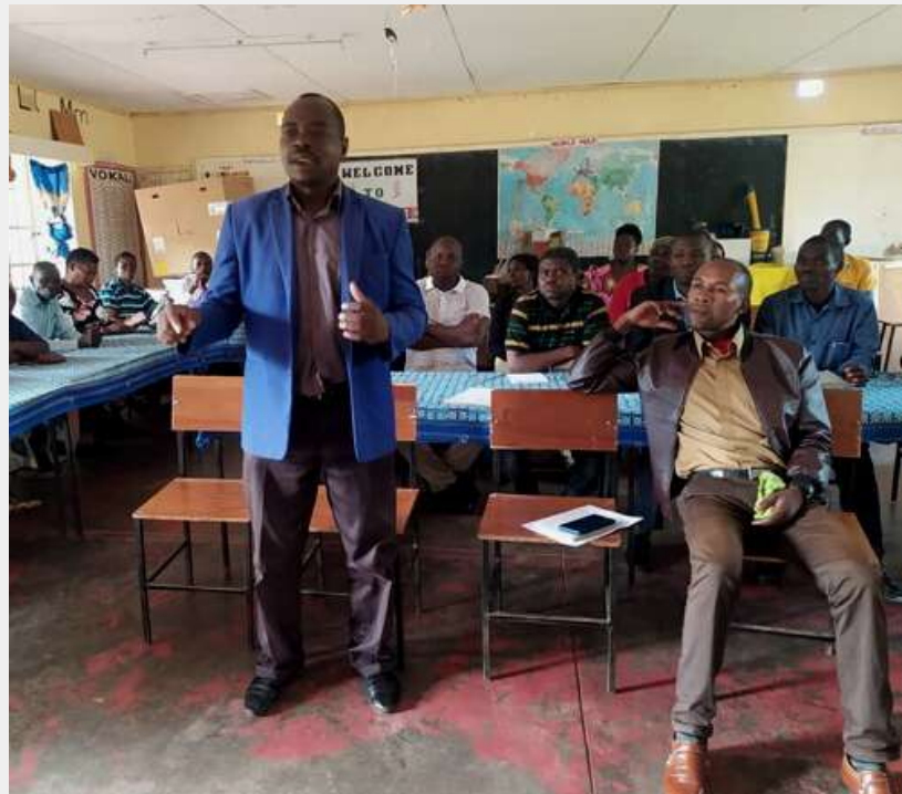
Insert: Stakeholders during the meeting in Rumphi district.

During the meeting, the authorities and stakeholders agreed to identify the most vulnerable children so that they can be linked to various service providers. It was also agreed that schools should stop chasing children from school because of non-payment of development funds, but instead engage the concerned parents.