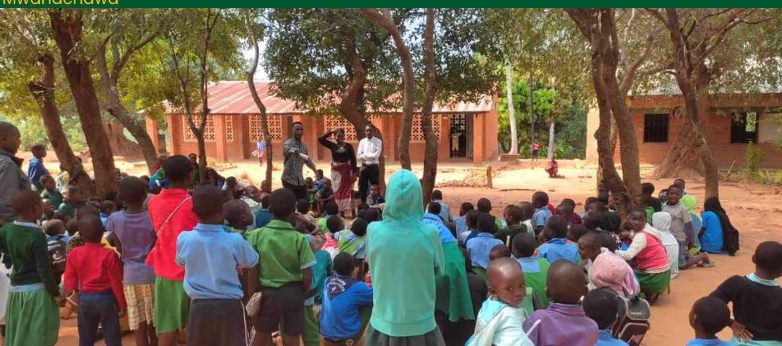
Insert: Some of the learners at the school listening to one of the field officers during the session in Nkhata Bay district.

YONECO has challenged the youth in the area of Traditional Authority (T/A) Mkumbira in Nkhata Bay district to exercise their rights in a responsible manner.