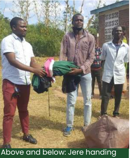
over clothes to survivors at the camp during the distribution exercise at Mbidi camp.

As the survivors of Cyclone Freddy strive to rebuild their lives and find strength amidst adversity, YONECO's continued mobilization of resources will undoubtedly play a pivotal role in supporting their recovery and helping them restore a sense of normalcy.