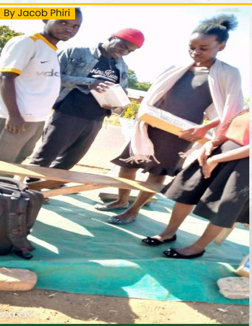
Insert: Some of the women that were reached with hygiene and sanitation messages.

Vendors, being a highly mobile and busy group, often face challenges in accessing essential services and vital information. Their constant movement and busy schedules can create a knowledge gap, leaving them unaware important aspects of life. Recognizing this issue, YONECO took proactive steps to address the conducting needs of vendors by Sexual Reproductive Health and Rights (SRHR) sessions at Ntaja Trading Centre.