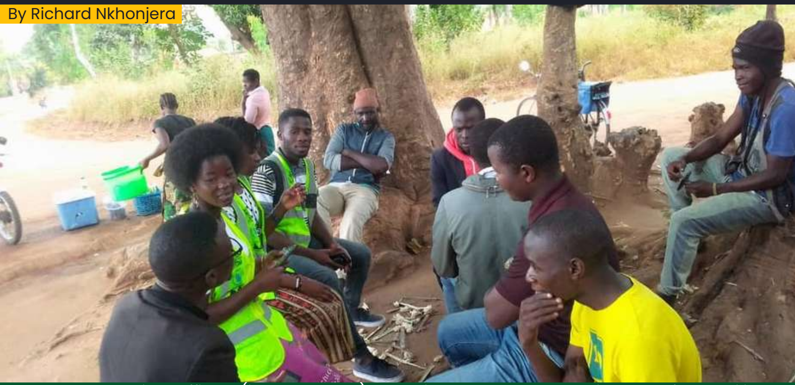
Insert: YONECO Field Officers (in green vests) engaging young people during one of the resilience and climate adaption sessions in Ntcheu district.

YONECO recognizes the potential which young Further to this, cholera has also accelerated an people have to transform their societies hence unprecedented cholera outbreak across the the organization invests in strengthening youth country. leadership skills. The sessions aim to support young people in realizing their full potential and Thus, the youth need to be involved in becoming active and engaged citizens who decision-making processes and be allowed to contribute to the overall development of their lead some interventions that are aimed at communities. addressing the current climate crisis.