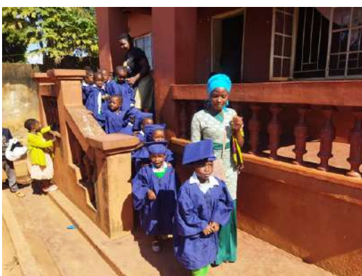
Insert: Parading to receive certificates and gifts.

In addition to addressing social issues, the event also emphasized the importance of sanitation and personal hygiene. Parents were advised to take proper care of their children by ensuring they bathe regularly, providing them with clean water, and offering wellbalanced and nutritious meals. These efforts were aimed at improving the overall well-being and health of the children.