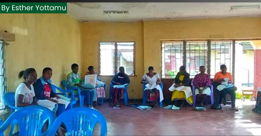
Insert: Participants during the GBV session at YONECO Mwanza Office listening to a presentation.

5th July 2023, YONECO with GBV and talk about the conducted a Gender Based challenges thev face (GBV) engagement seeking help or justice. session with sex workers and community members in YONECO further provided available Mwanza district. information on