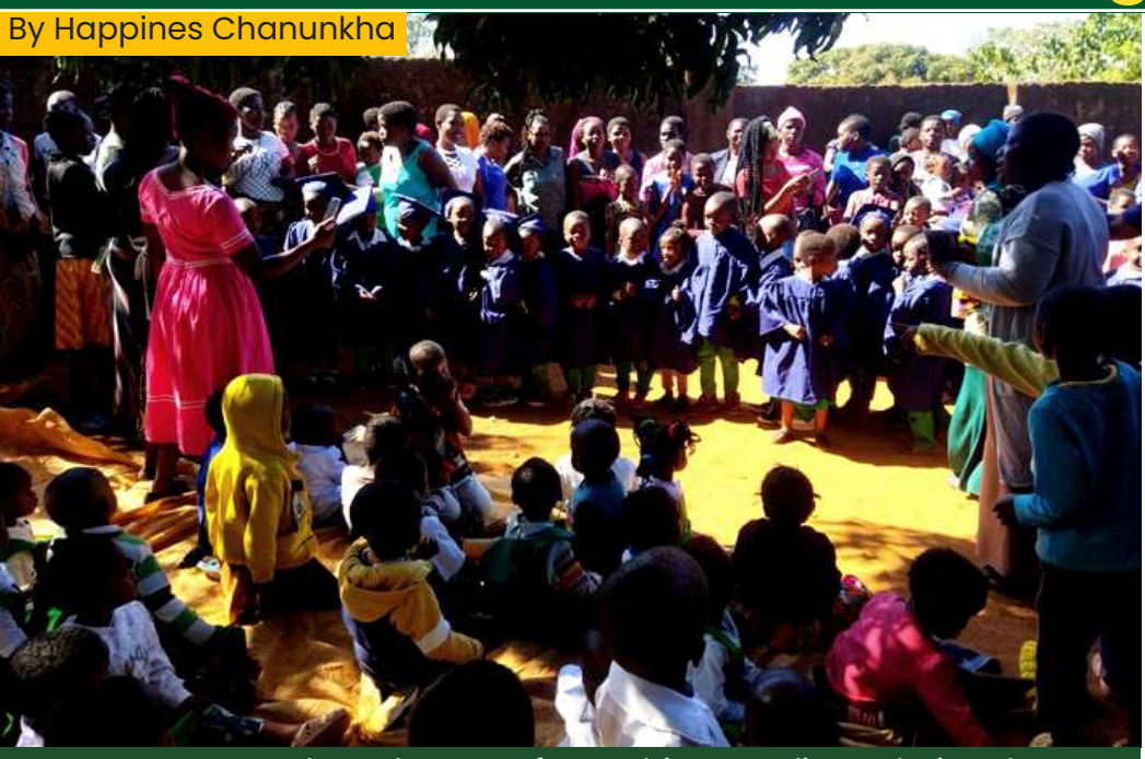
Insert: Parents and ECD learners from Chinamwali DIC during the graduation ceremony.

July 2023, the 19th Childhood Development terminal school session DIC Chinamwali came to successful conclusion, as 68 young children (24 boys and 42 girls) took The issue of drug and substance their exams. Of these, 60 children abuse, (30 boys and 30 girls) passed their excessive exams, and an impressive 30 cocaine, and mandrax, was also graduates were prepared to move addressed during the event. The on to Standard 1.