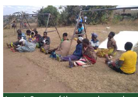
Insert: Some of the members who attended the awareness session.

proactive measure, youth а management. incidents of GBV or related