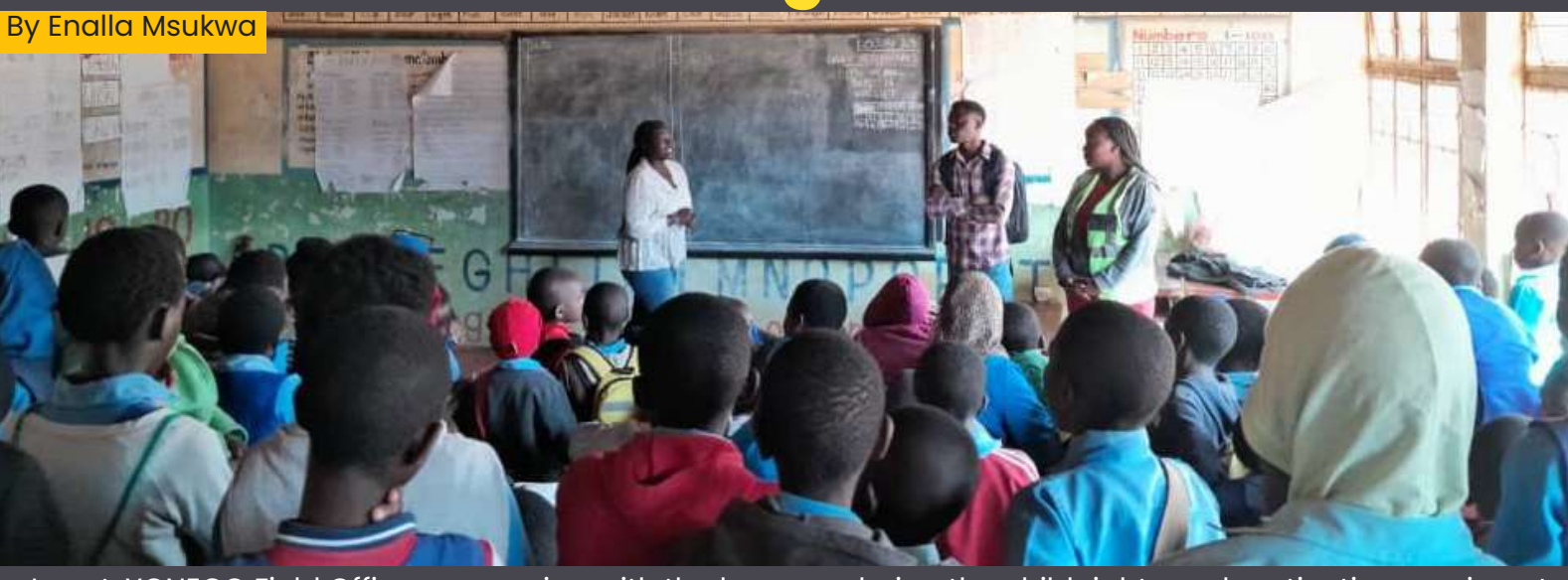
Insert: YONECO Field Officers engaging with the learners during the child rights and motivation session at Limbe Primary School.

organized a session at Limbe Primary can become role models for able School, focusing on child rights and others and motivation. The aim of this session around them. twofold: to motivate the students to excel in their studies and In the spirit of recognizing their instruments protecting the rights of to empower them with knowledge rights, about their rights as children.