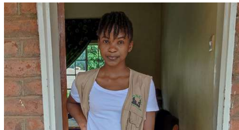
Insert: I carry with me the lessons learned, the skills gained, and the unwavering belief that dedication and passion can truly pave the way for remarkable accomplishments.

She is encouraging all young minds embarking on their own journeys to remember that every opportunity, no matter how small, has the potential to shape their future in extraordinary ways. “Seize it, make the most of it, and let it propel you toward your dreams.”