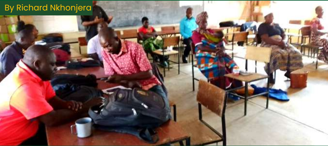
Insert: Some of the SASA facilitators who were trained in the SASA Together toolkit in Dedza.

community as a whole pledge to undertake actions that will perpetuate positive change over the long term.