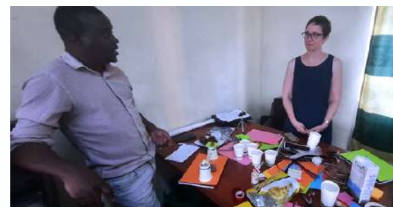
Insert: One of the participants providing meaning during a metaphor session.