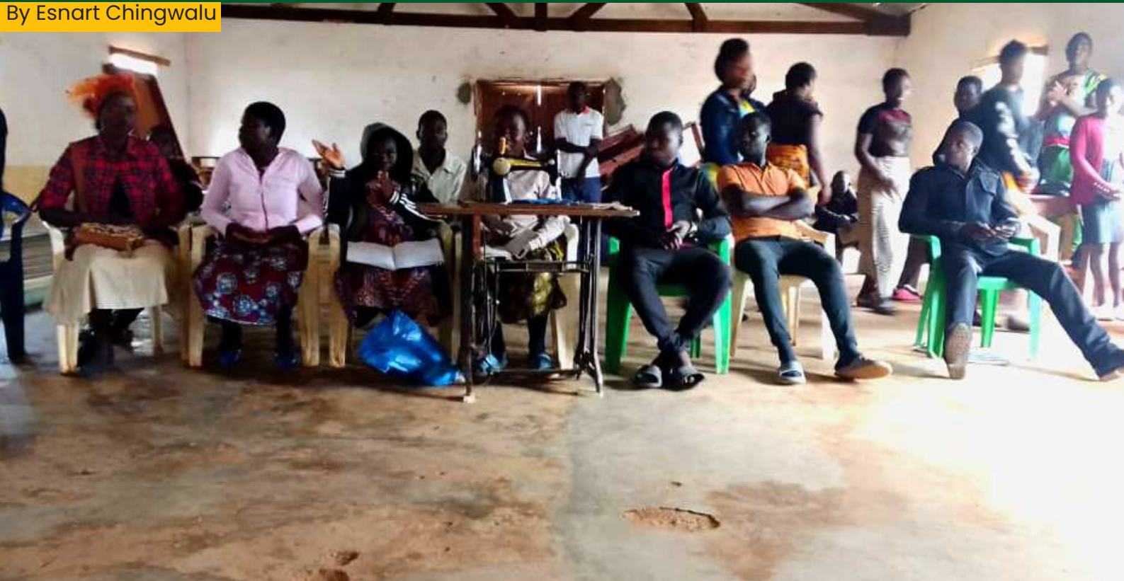
Insert: Members of Khosolo CBO during the comprehensive sensitization meeting

YONECO at Khosolo EPA in Mzimba counseling services and equip the attendees with the district facilitated a reporting instances of tools to effectively address comprehensive sensitization violence or harm that they issues such as violence and meeting focused on enhancing might encounter. human rights.