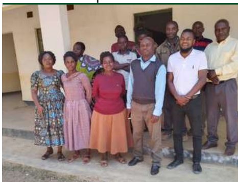
Insert: Some of the teachers who were trained at Muselema Primary School

observed on June 16th, held the theme 'Rights of the Child in the Digital Environment,' reflecting the evolving landscape of childhood experiences.