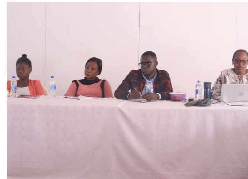
Insert: Some of the participants who were part of the workshop at Naming'azi Training Centre

The workshop empowered participants with the confidence to engage stakeholders and community members, effectively addressing key human rights issues under the Ufulu Wanga Project.