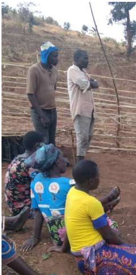
Insert: Members of Mbombo VNRMC during the Environmental Conservation meeting in Ntchisi

By prioritizing soil health, water conservation, biodiversity preservation, and land degradation reduction, SLM practices prove their worth as a transformative approach. Executed across Kasungu, Ntchisi, Dowa, and Mzimba, the SAMALA Project's implementation by Total LandCare Global, World Agroforestry - ICRAF, and YONECO is supported by Irish Aid and the Government of Flanders, showcasing the commitment to sustainable land management principles.