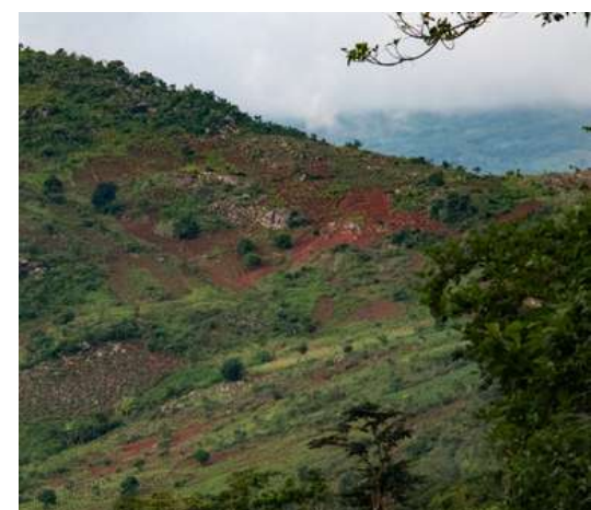
Insert: Results of human activities on the environment are devastating.

Additionally, participants received guidance on joining Village Savings Groups, which can provide a platform for investment in small-scale businesses that are less harmful to the environment. This impactful awareness campaign reached a total of 19 charcoal sellers. By enlightening these individuals about the broader implications of their activities and offering viable alternatives, YONECO is striving to pave the way for a more sustainable future, where human actions are in harmony with environmental well-being and economic prosperity.