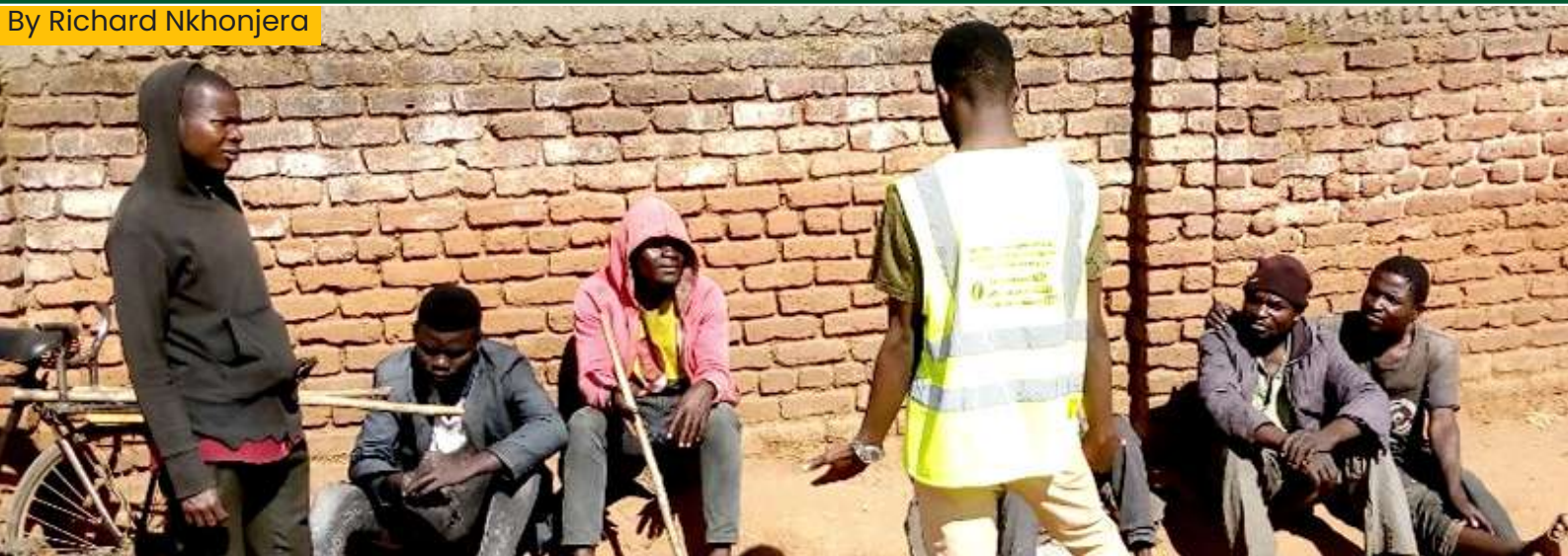
Insert: Some of the people who were engaged during the awareness campaign

Charcoal and firewood continue to serve as reliable energy sources for the people of Malawi. However, it is noteworthy that certain shocks and disruptions within the country can be attributed to human activities, specifically the practice of charcoal burning and selling, pursued as a means of livelihood. While this economic approach has its merits, it also contributes to various adverse impacts, including environmental degradation and consequent shocks. To address this, it is imperative to explore alternatives that can mitigate the repercussions stemming from such human-induced activities.