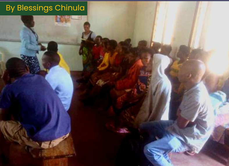
Insert: An Officer from YONECO (Standing) during the economic empowerment session at Milepa

With unwavering optimism, we extend our heartfelt wishes for an auspicious journey to the 20 remarkable women who actively participated in this session. Their determination coupled with our collective support, serves as a beacon of hope, heralding a future of tangible achievements.