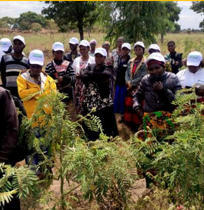
Insert: Farmers appreciating some of SAMALA project interventions during the learning visit in Kasungu

In a pursuit to achieve both enduring environmental sustainability and socioeconomic prosperity, the implementation of Sustainable Land Management (SLM) practices takes center stage. These practices, centered on responsible land resource utilization, aim to boost productivity while minimizing detrimental environmental effects.