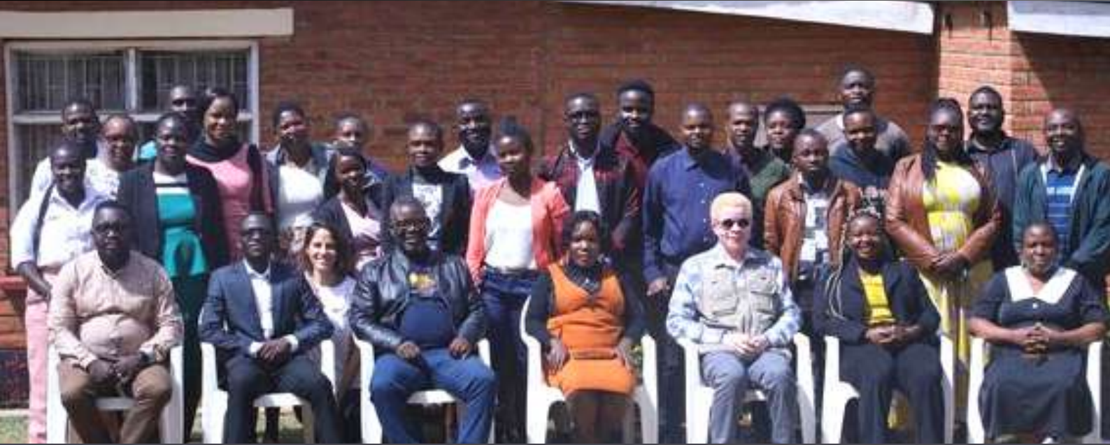
Insert: YONECO, Beyond Suncare and Standing Voices members of staff posing for a group photo after the training in Zomba.

From August 8th to 9th, 2023, the collaborative efforts of partners within the Ufulu Wanga Project manifested in a two-day information-sharing workshop held at the Naming'azi Training Centre in Zomba.