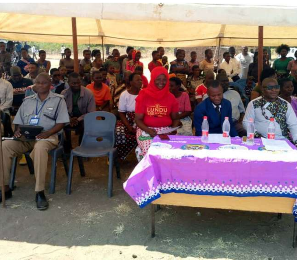
Insert: Some of the district stakeholders captured during the commemoration ceremony in Blantyre.

The commemoration of the 2023 Acknowledging the dual nature Day of the African Child (DoAC) of technology, Maliti also witnessed YONECO's enthusiastic lauded its potential for participation in a significant event advancing education and held at the Tafika Community- information access. The annual Based Organization (CBO) Ground Day of the African Child, in Blantyre.