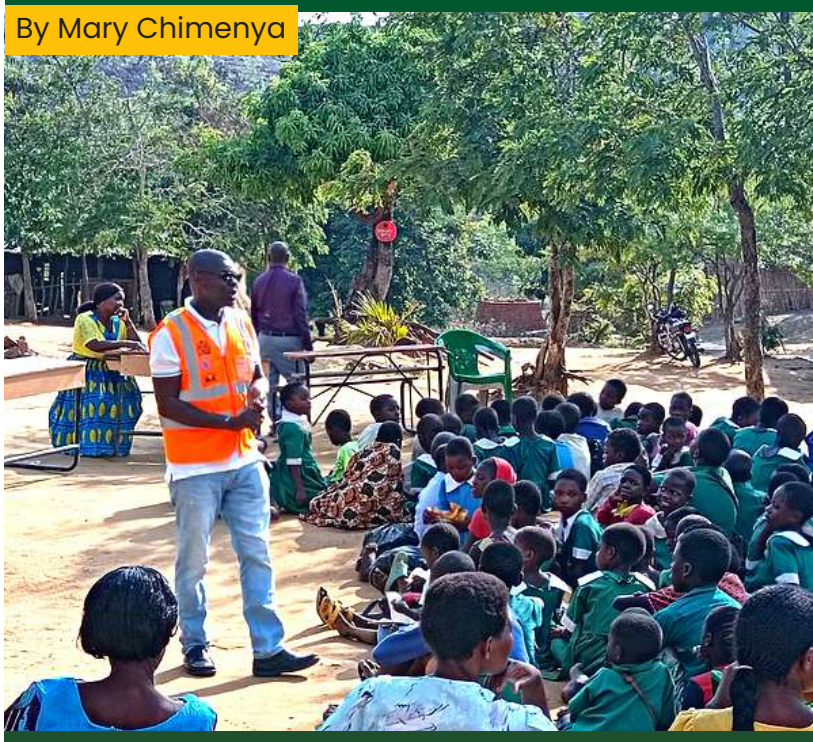
Insert: YONECO staff engaging with the learners during the drug and substance abuse session.

On November 21, 2023, a session on drug and substance abuse was conducted by Mwanza staff at Kaware Full Primary School, reaching a total of 347 pupils (196 females, 151 males).