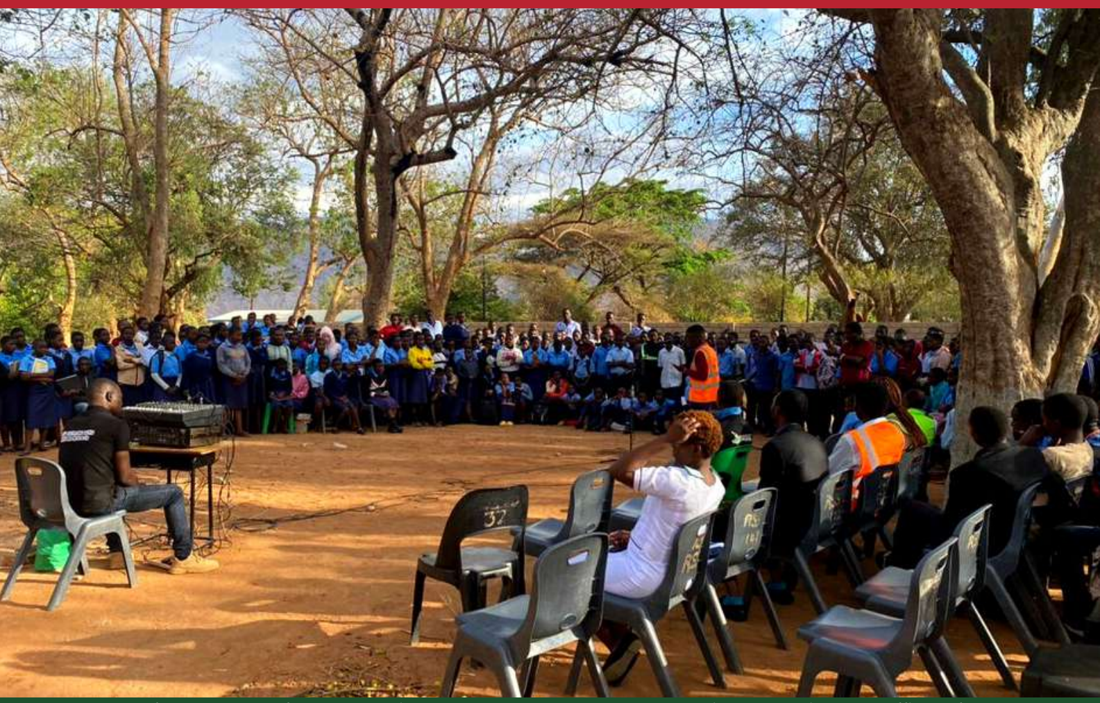
Insert: Some of the students from Rumphi Secondary School who took part in the session and officers from YONECO, Rumphi District Hospital as well as Rumphi Police.

student's educational journey and it is at this point provided that many young people reflect and plan for their obstacles. future endeavours. YONECO in Rumphi took time to inspire and motivate students at Rumphi Secondary The interactive nature of the session which School (RUSESCHO) at a school open day which was incorporated activities such as drama, poetry, held on November 3, 2023. The session served as a and freestyle lyrics, ensured active participation platform for addressing the unique challenges faced from the students. Role models from various by secondary school students and providing them professions, including a nurse and a police with the guidance and motivation needed to officer, contributed to the session, providing realnavigate this crucial phase successfully.