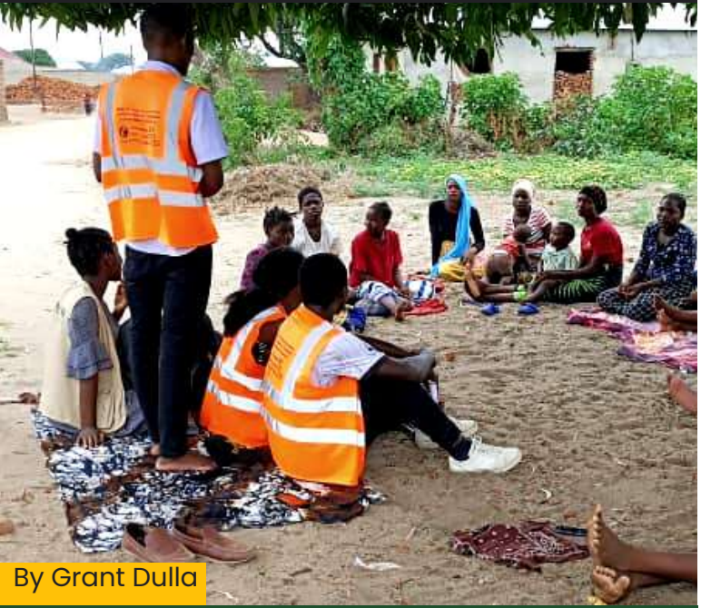
Insert: YONECO District Manager for Blantyre engaging with the learners.

In response to the growing concern of idle youths in Mangochi, YONECO has taken proactive steps to address the issue through comprehensive sessions on youth development at Kachere Youth Club.