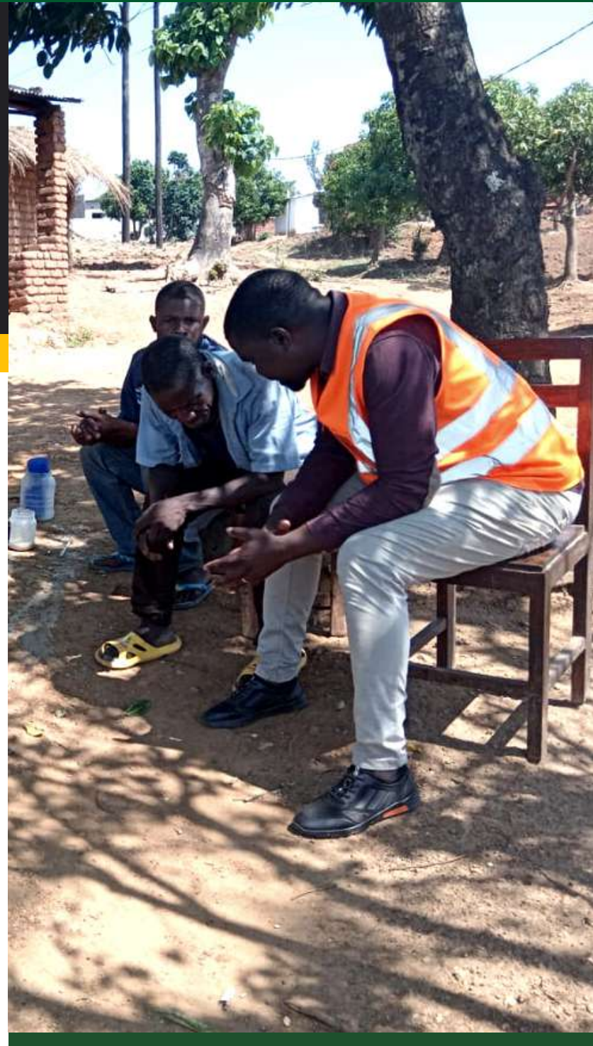
An officer from YONECO in mwanza captured here conducting the session.

recognizing the interconnected their issues. nature of men's health with broader societal well-being. The session further emphasized The session underscored the value of involving the significance of regular check-ups and healthcare problems, thereby promoting a proactive promoting approach to health maintenance.