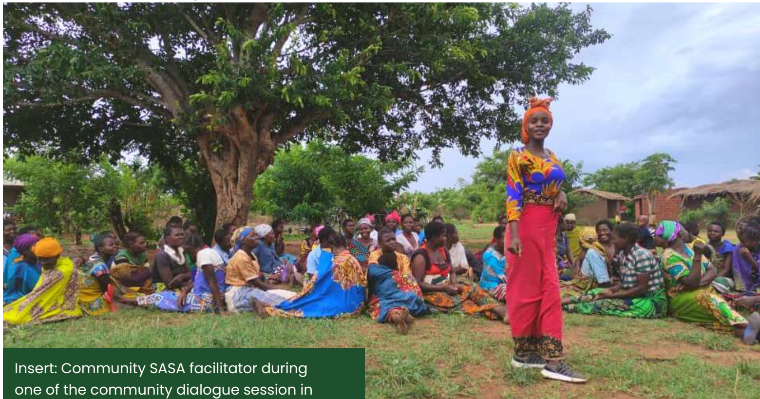
Insert: Community SASA facilitator during one of the community dialogue session in Dedza.

Community leaders from the area of Traditional Authority (TA) Kaphuka in Dedza district have described dialogue sessions as instrumental in preventing Gender-Based Violence (GBV).