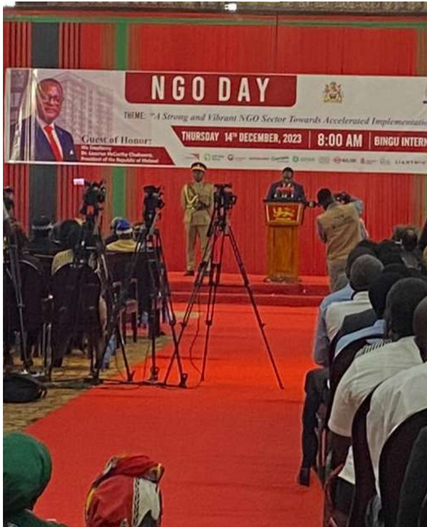
Insert: Guest of Honor, His Excellency Dr. McCarthy Chakwera, making his speech during the event. Below right: YONECO staff captured at the pavilion that was set at BICC

At YONECO, we are grateful to the NGO Regulatory Authority – NGORA for organizing an incredible NGO Day, which took place at the Bingu International Convention Centre (BICC) in Lilongwe on 14 December, 2023. The interactions and exchange of ideas will significantly contribute to the creation of a strong and sustainable socioeconomic growth of the Malawian society we all aspire to realize. The event offered a platform to YONECO, various development partners as well as the general public to connect and engage in meaningful dialogue towards attaining an equitable environment for all people.