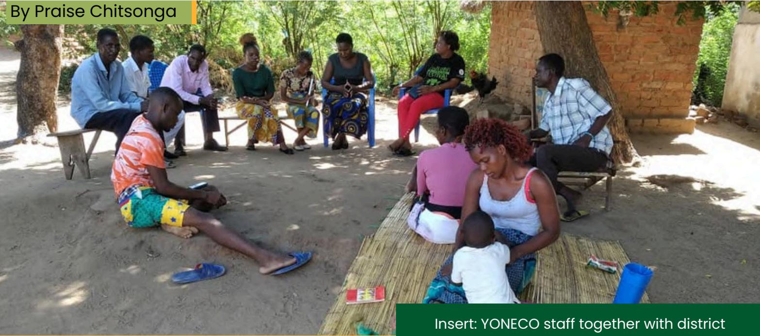
Insert: YONECO staff together with district stakeholders during one of the awareness sessions in GVH Mnemba in Nsanje

YONECO, through the Tithandizane National Helpline Services, in conjunction with Nsanje police and Nsanje District Hospital conducted an awareness session and provided HIV testing and counseling (HTS) services in Zuze village, GVH Mnemba, in Nsanje district. During the exercise, 17 clients underwent HIV testing and counseling, 4 underwent STI screening, 1 accessed ARVs, and 4 received PrEP. Additionally, 2,010 male condoms were distributed, and 24 women received family planning methods.