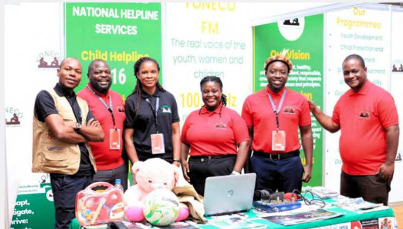
Insert: YONECO staff posing at the pavilion which they set up during the event.

Honourable Kamtukule recognized YONECO's presence in Zomba, a city rich in heritage and