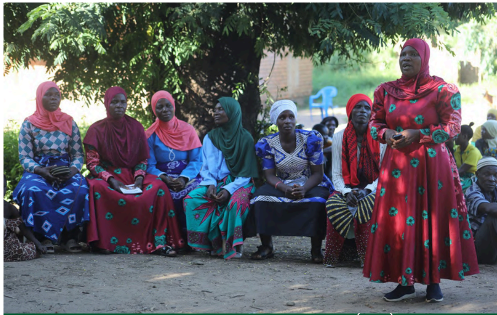
Insert: Member of Area Development Committee (ADC) making her remarks during the one of the awareness campaign meetings at TA Mposa in Machinga district.

During sensitization sessions, CHWs and community members discussed several mitigation