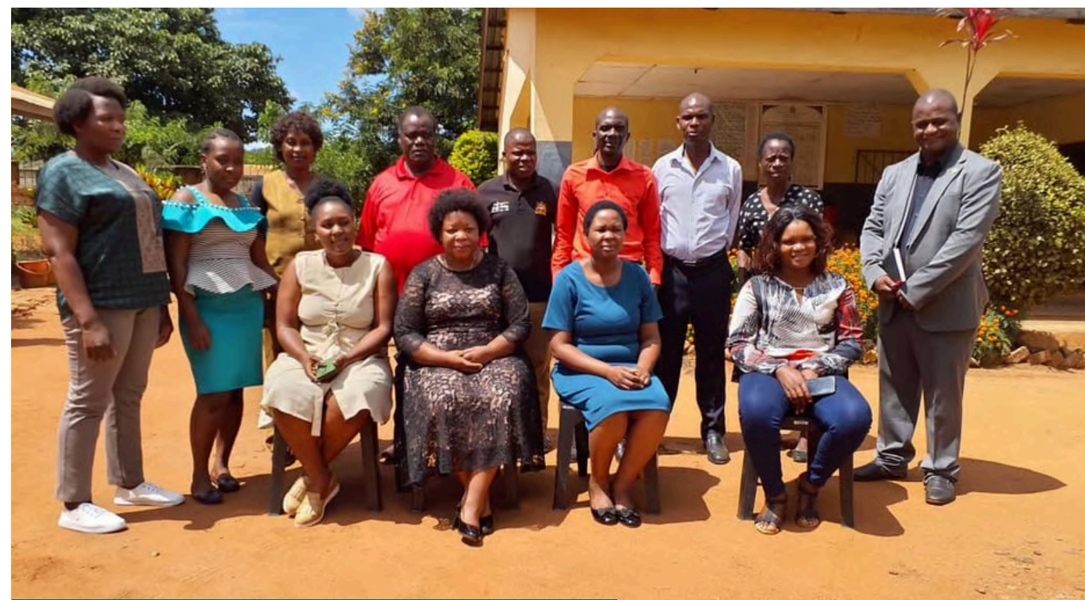
Insert: Participants posing for a group photo after the training session in Lilongwe.

The trained facilitators have been engaged to support adolescent HIV prevention interventions which YONECO is implementing in communities surrounding the following health facilities; Kawale, Bwaila, Kangoma and Area 18.