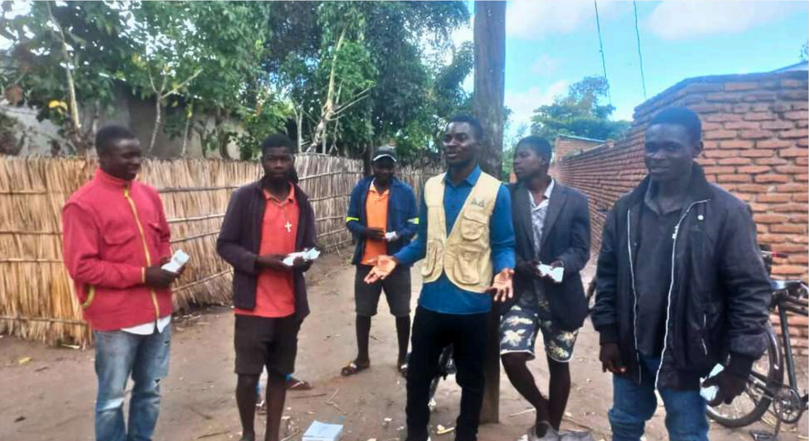
Insert: Field Officer for YONECO in Mangochi district during the SRHR awareness with some young people.

YONECO carried out a Sexual Reproductive Health (SRHR) awareness campaign on 15 June 2024, targeting young individuals in Kalonga village, Mangochi district.