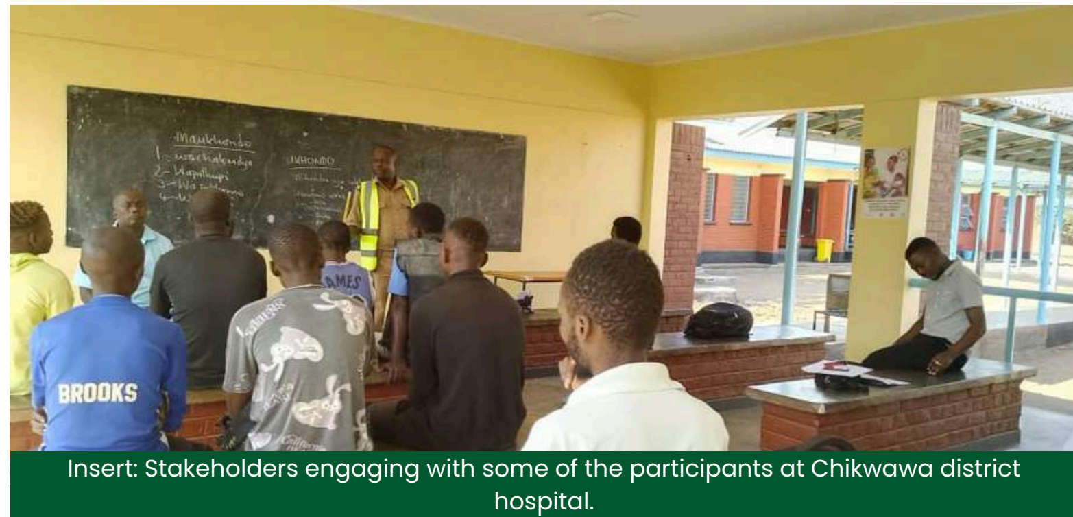
Insert: Stakeholders engaging with some of the participants at Chikwawa district hospital.

YONECO in collaboration with Angaza The participants were educated on their rights Foundation, healthcare workers, social welfare to healthcare services and provided with and the Malawi Police conducted a 'Know your information on where and how to access provider' initiative to enhance access and confidential and stigma-free HIV services. uptake of HIV services among high-risk key populations in Chikwawa district.