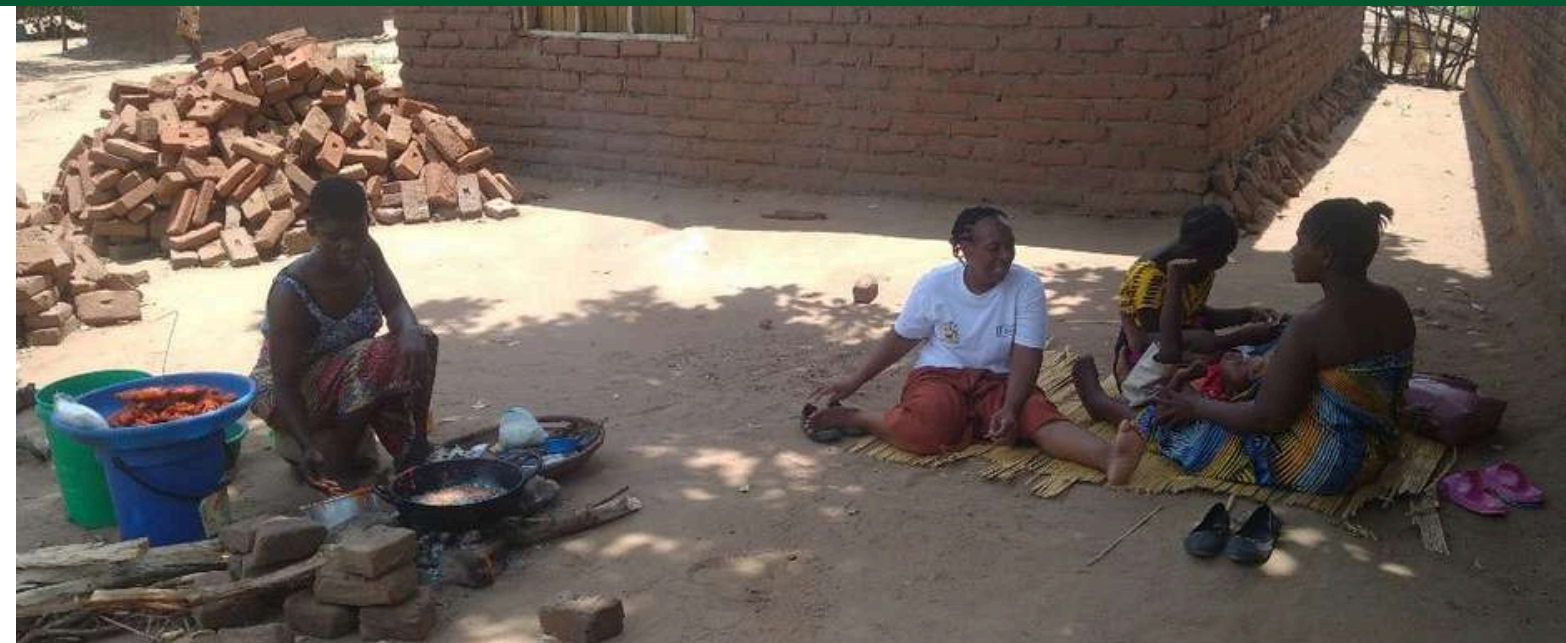
Insert: District Manager for YONECO in Chikwawa interacting with some women during the GBV and child abuse awareness sessions which the district conducted.

Divorce and separation are common in Malawi. Many women and their children suffer as men, mostly the primary breadwinners, tend to neglect their responsibility of providing child support after separation.