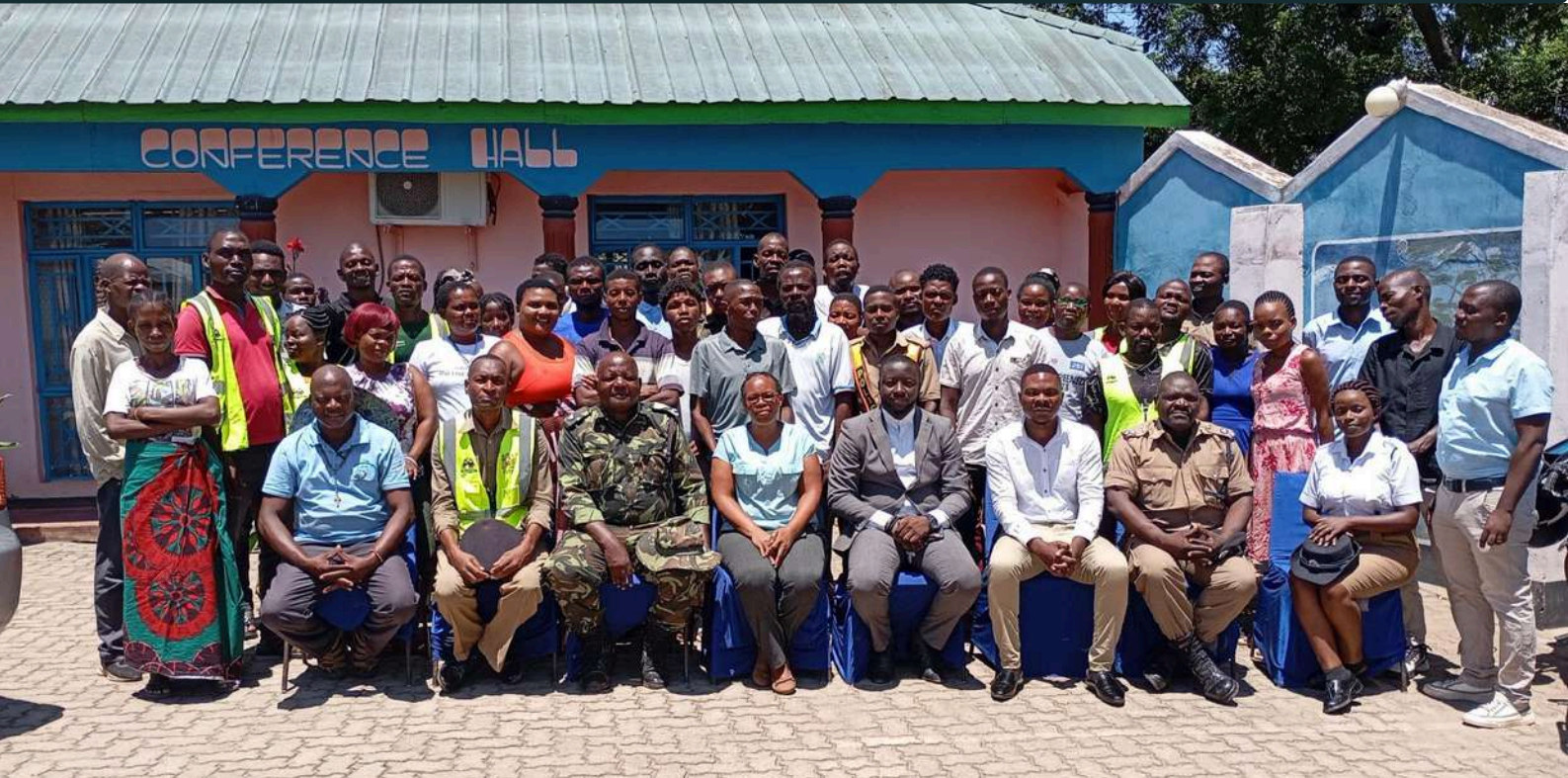
Insert: Stakeholders posing for a group photo after the Know-Your- Service Provider session at Hope Lodge in Chikwawa district.

YONECO organized a 'Know Your Service Provider' session in Chikwawa where officials from the Police, Prison Service and the judiciary presented to the public how their respective offices function.