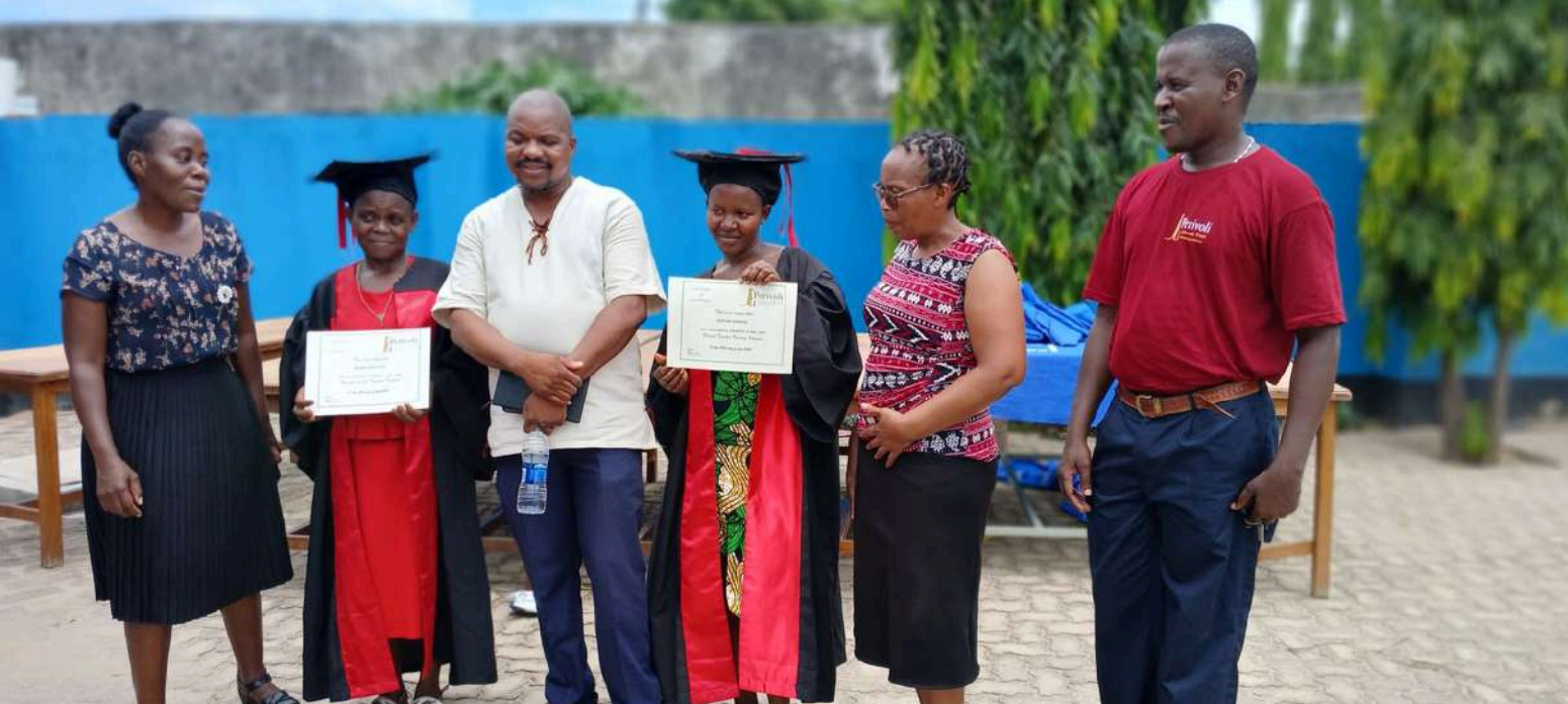
Insert: Chikwawa district social welfare officer together with YONECO and Perivoli Schools Trust staff and graduates after the graduation ceremony.

On 7 December, 2024, two of YONECO’s Early Childhood Development (ECD) caregivers were among 52 graduates who received certificates after successfully completing a two-year Teachers Training programme that was organized by Perivoli Schools Trust in the Chikwawa district.