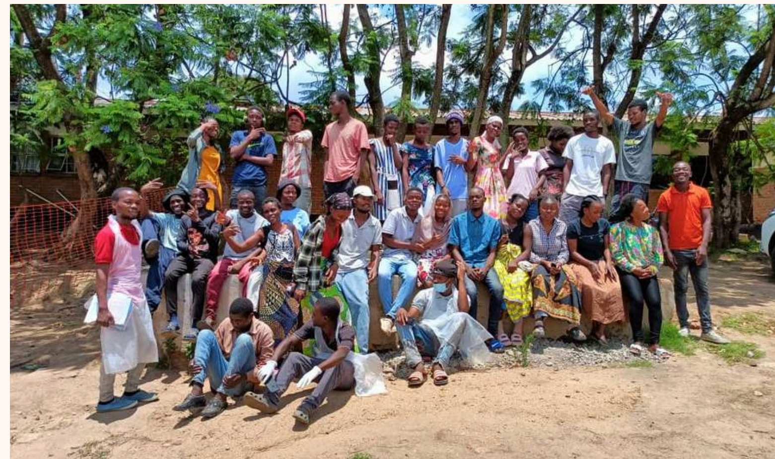
Insert: Young people Active Youth Association (AYA) with their counterparts from Machinjiri posing for a group photo.

YONECO in partnership with Active Youth Association. (AYA) and various youth clubs mobilized young people from Machinjiri for a clean exercise at South Lunzu Health Centre in Blantyre.