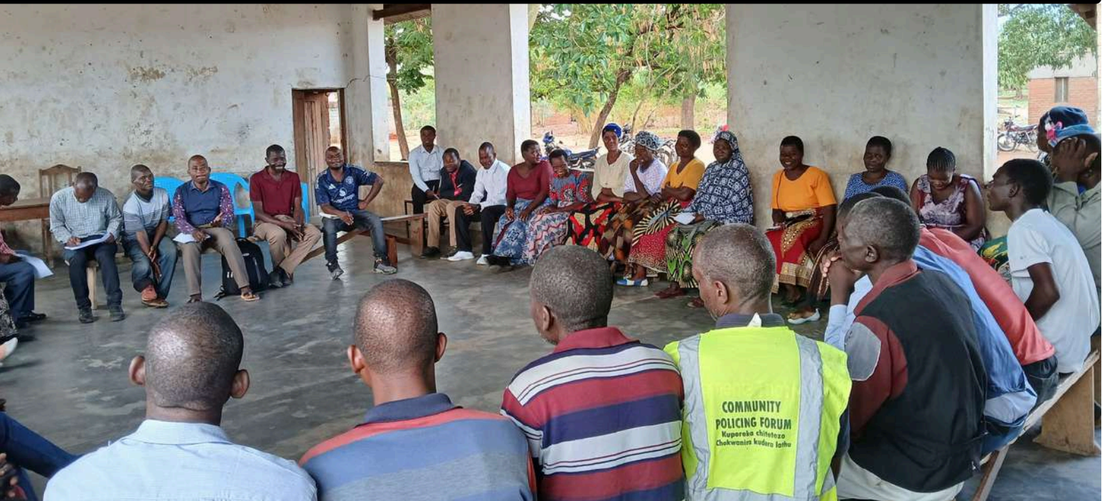
Insert: Part of the community groups that attended the meeting

In a bid to promote women's involvement in conflict resolution, YONECO has been facilitating community dialogue sessions focusing on the importance of having women as equal partners in peacebuilding efforts.