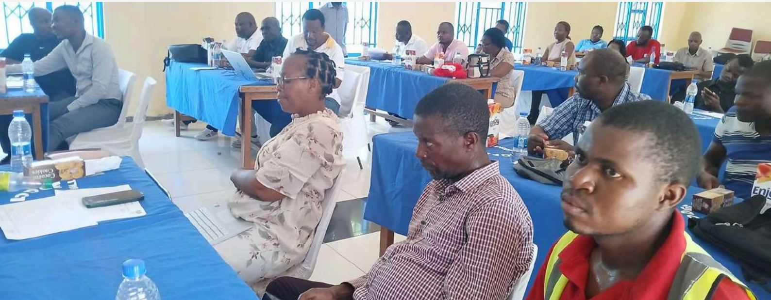
Insert: Representatives from various partners and departments who attended the meeting in Chikwawa.

Chikwawa District AIDS during the 2024 event for the 2024 World AIDS Coordinating Committee (DACC) implementation period. Day. has hailed YONECO for its role in contributing towards the YONECO presented some Following the presentation, the increasing access to HIV services figures on the total number of DAAC Chairperson hailed among men and key populations. community members who YONECO for the have been enrolled in the accomplishments achieved in The commendation was made by program and the number of the year and commended the the chairperson of the committee people who have been organization for regularly during a review meeting that was supported to access various updating stakeholders on held in the district on 18 services. Some of the services project status. December, 2024. The review which the targeted community meeting was organized by members accessed include HIV Among other challenges, it YONECO to provide updates on the self-testing, Sexual Gender- was indicated that some progress of Addressing Unmet based Violence (SGBV) people cover long distances Needs in HIV Testing Services for counselling, as well as Sexual to access services like PrEP, Men and Key Populations which is and Reproductive Health (SRH) frequent stockout of some SRH being funded by the Centres for commodities like condoms and commodities, turnaround Disease Control and Prevention lubricants. times (TAT) for viral load (CDC). results.