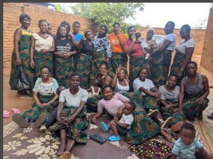
Insert: Women who took part in the GBV engagement session from Matama Village in Zomba.

The Tithandizane Helpline officers further encouraged the women to form Savings and Loans Groups (SLGs) which have proved to be one of the effective ways of empowering women economically.