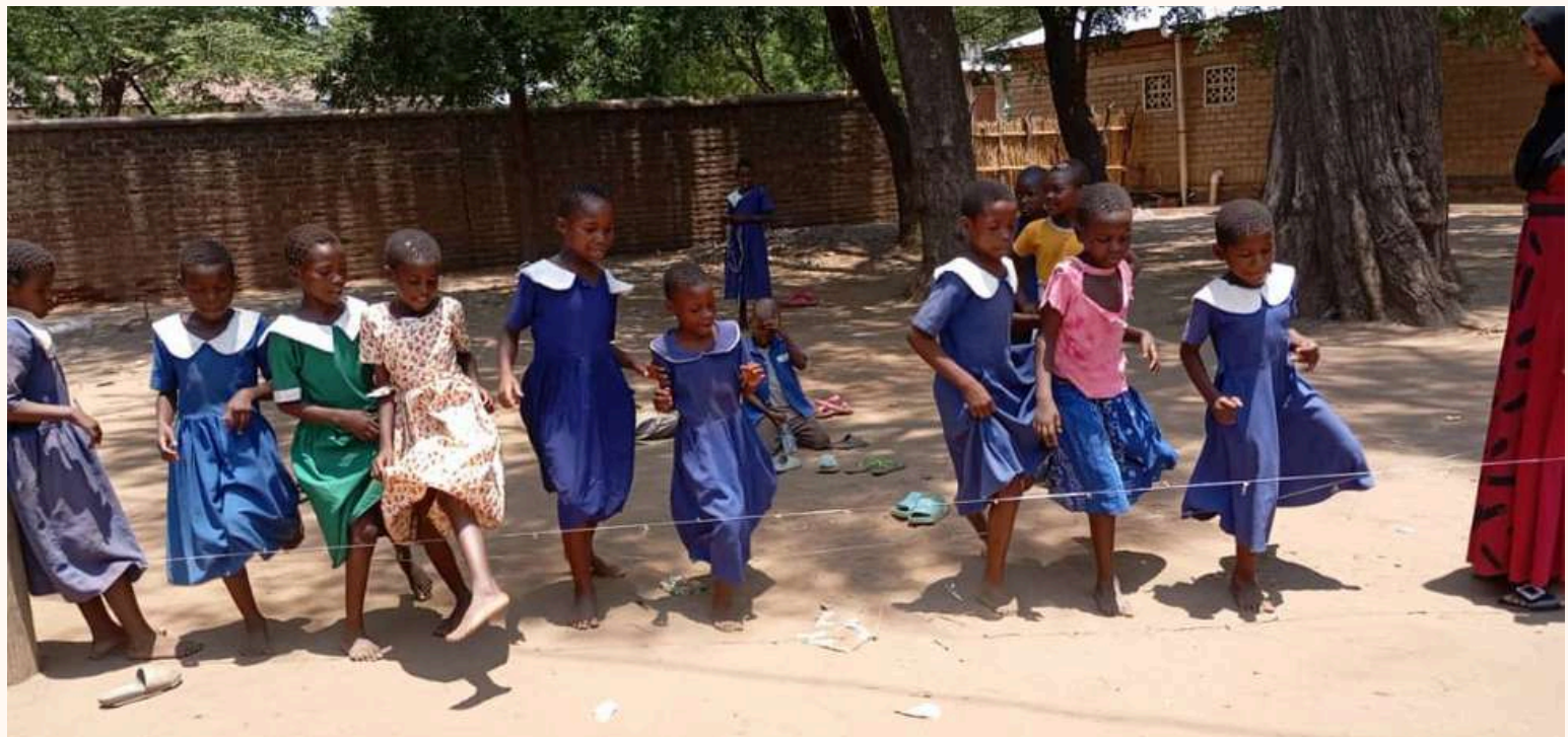
Insert: Some of the children who patronize the Drop in Centre (DIC) in Chikwawa captured here playing.

Child development is one of YONECO's strategic goals whose related interventions are being implemented in all the organization's district offices across the country including Chikwawa where various key activities are being conducted to contribute towards child growth, protection and development.