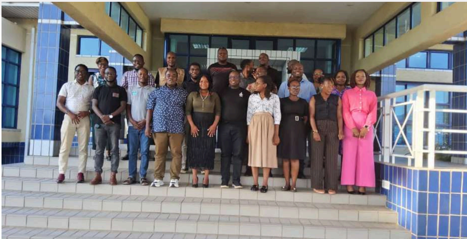
Insert: Participants posing for a group photo after the 2 day training session in Blantyre.

From 17 to 18 December, 2024, YONECO facilitated a training session on management of Complaints and Feedback Mechanisms (CFMs) and handling of reported cases under ECHO Malawi Drought Response Project.