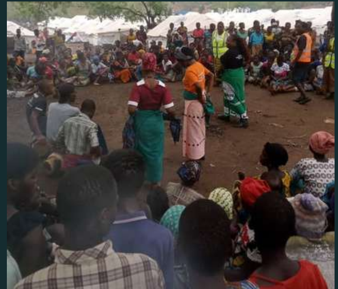
Insert: YONECO Cultural Troupe members using theatre as a tool for providing PSS to the refugees.

The refugee communities include children, the elderly, people with disabilities, and expectant women.