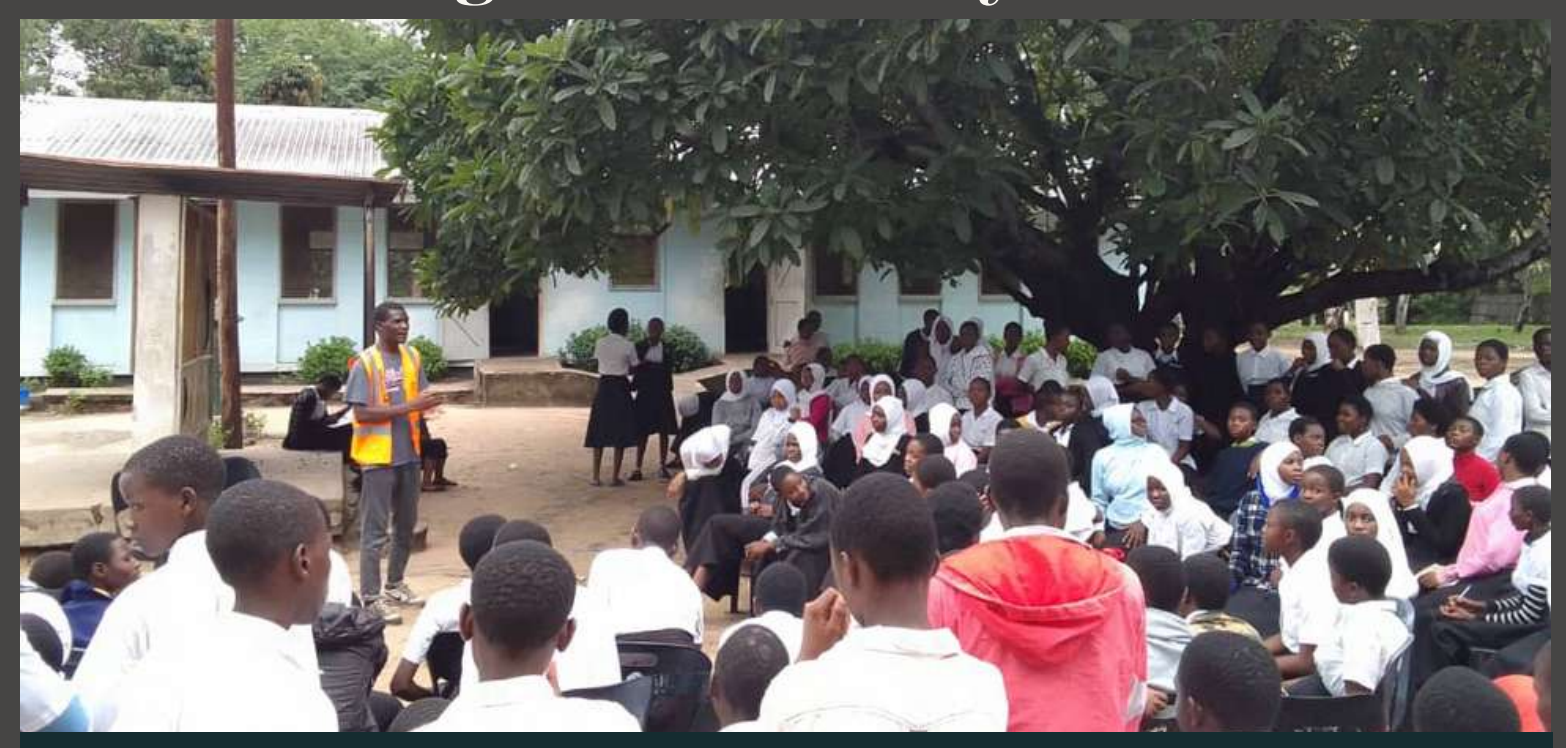
Insert: YONECO Field Officer for in Mangochi district during career guidance session with learners at Mangohi Secondary School.

Career guidance sessions in schools are very important. The sessions help students in decision-making, setting realistic goals, and bringing in a sense of motivation.