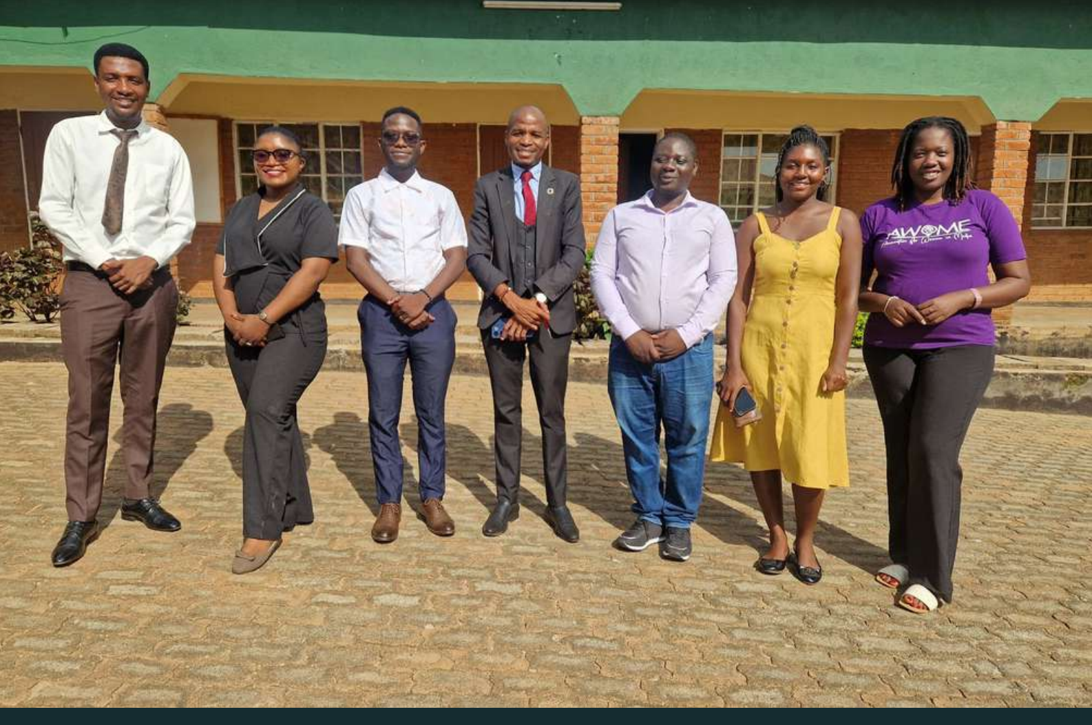
Insert: YONECO and Edukans team after signing the MoU at YONECO head office in Zomba.

YONECO FM (YFM) officially signed a Memorandum of Understanding (MOU) with Edukans at YONECO's headquarters in Zomba.