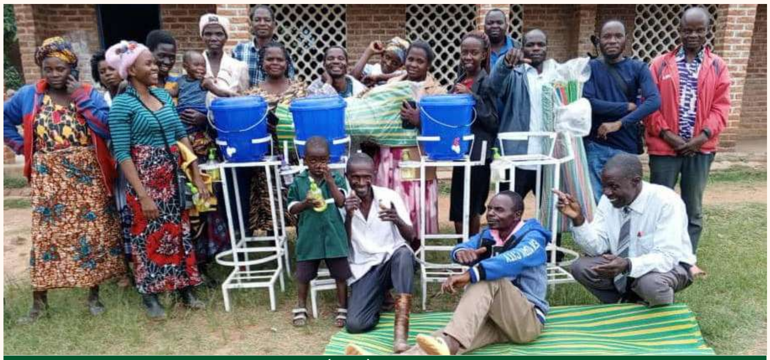
Insert: School Management Committee (SMC) members for Miyombo Primary School in Chitipa district together with YONECO staff after the handover of the materials.

YONECO distributed classroom mats, liquid soap bottles, and buckets at Miyombo Primary School in Chitipa district.