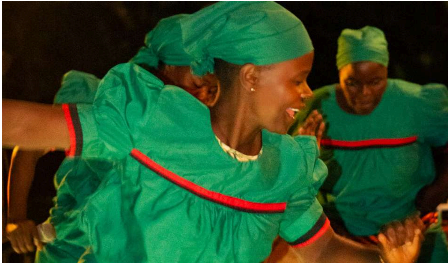
Insert: YONECO Cultural Troupe performing one of their pieces during the Healing and Rhythm session in Zomba

YONECO Cultural Troupe and the University of Malawi (UNIMA) 21st Gen Club, organized a Healing and Rhythm session that was held on the evening of 22 March, 2025 at Blend Kitchen and Lounge in Zomba.