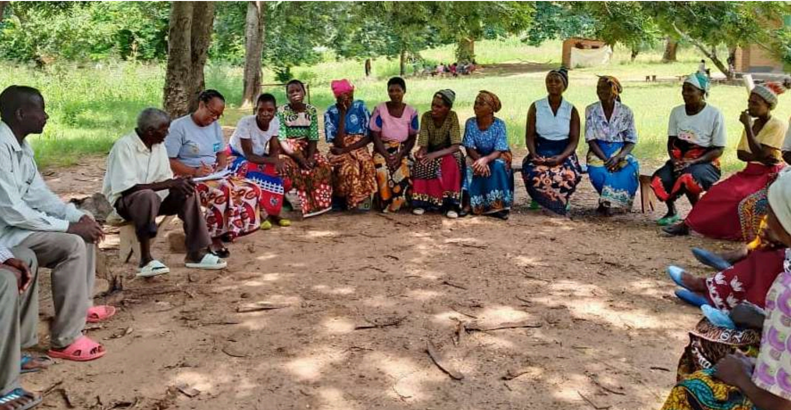
Insert: Members of Mwendowangoma Savings and Loans Group pictured here together with YONECO District Manager for Chikwawa during the meeting.

Mwendowangoma Savings and Loans Groups (SLGs) was established under the Social Protection for Gender Empowerment and Resilience (SP-GEAR) Project in September 2024 in the area of Senior Traditional Authority (STA) Golasi in Chikwawa.