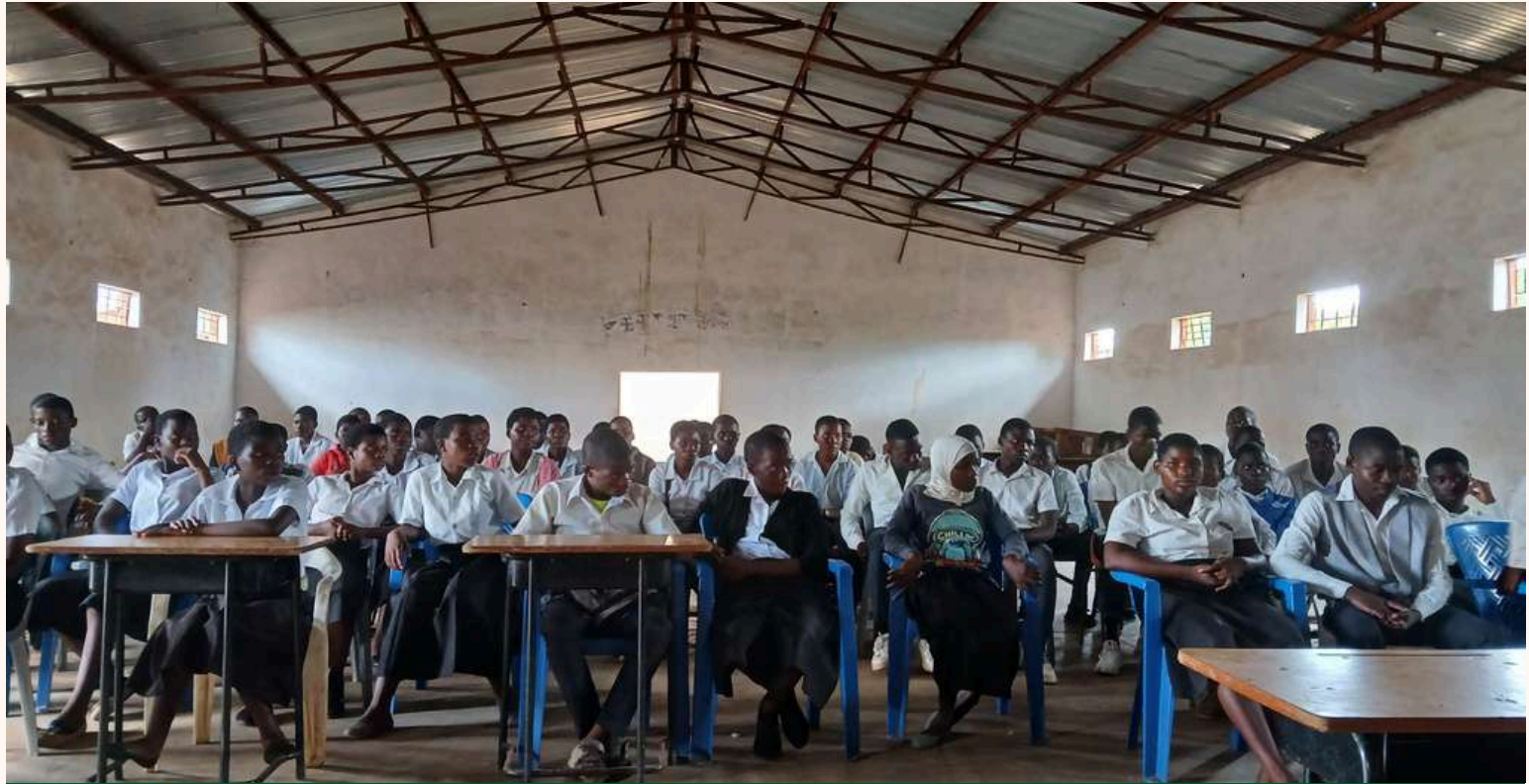
Insert: Students at Mpatsa Secondary School captured here during one of the role modelling and counselling sessions in the district.

On February 14th and 16th, YONECO partnered with CAVWOC (Centre for Alternatives for Victimized Women and Children) to conduct role modelling and career guidance sessions for children receiving bursaries from CAVWOC. The goal of these sessions was to inspire students and provide them with the knowledge and motivation to navigate their educational paths and future careers.