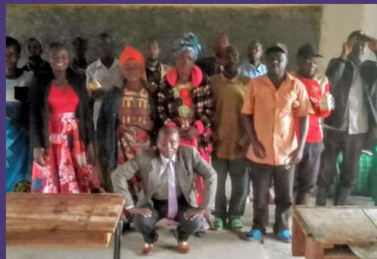
Insert: Participants posing for a group photo after the engagement session at Chipitu Primry school in Chitipa district.

The engagement meeting was attended by Primary Education Advisors (PEAs), members of various community structures including Parent-Teacher Association (PTA), Mother Group (MG), School Management Committee (SMC), as well as village heads.