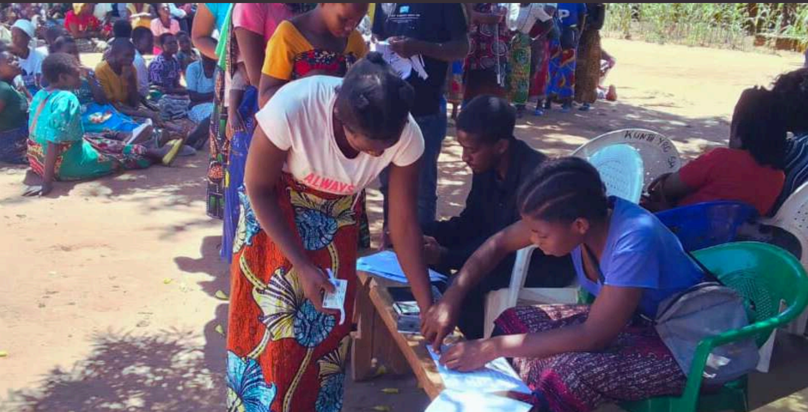
Insert: Beneficiaries of the cash disbursement program in Blantyre being registered and vetted during the exercise in TA Kunthembwe.

As a way of ensuring transparency and accountability, YONECO officers from Blantyre were on the ground in the areas of TA Chigalu and Kunthembwe where Cash Disbursement program under ECHO project was conducted.