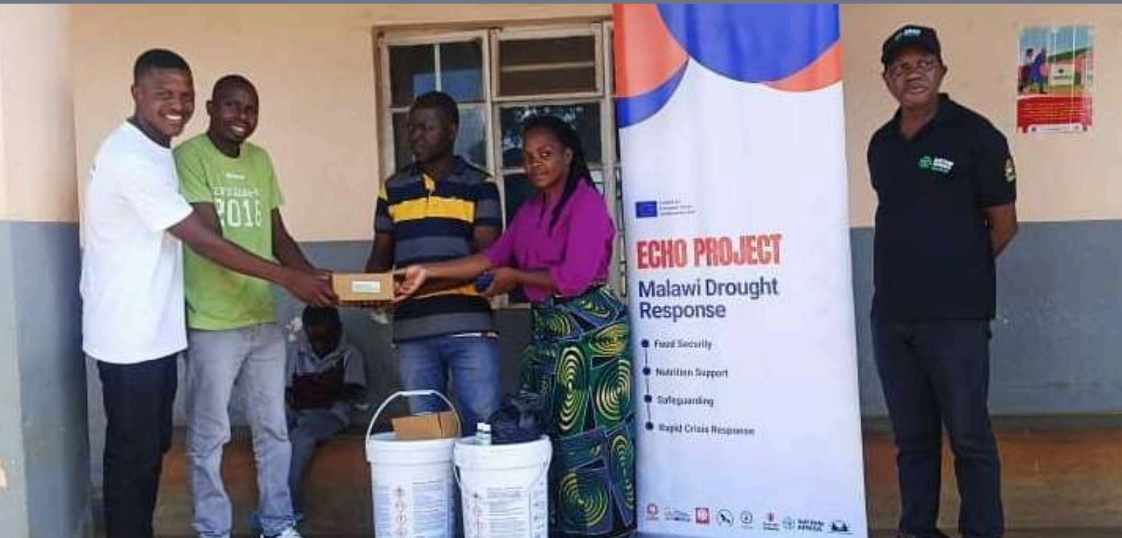
Insert: Chief Preventive Health Officer for Thyolo District Hospital receiving the items from YONECO Field Officer in the district during the handover ceremony.

Partners that are implementing the Malawi the Tropical Cyclone which led to the Drought Response Project, which is being contamination of water sources and sanitation funded by ECHO, have handed over Water, facilities in the affected areas,” explained the Sanitation and Hygiene (WASH) materials to Chief Preventive Health Officer. Thyolo District Council to support 188 households that have been affected by Cyclone Jude.