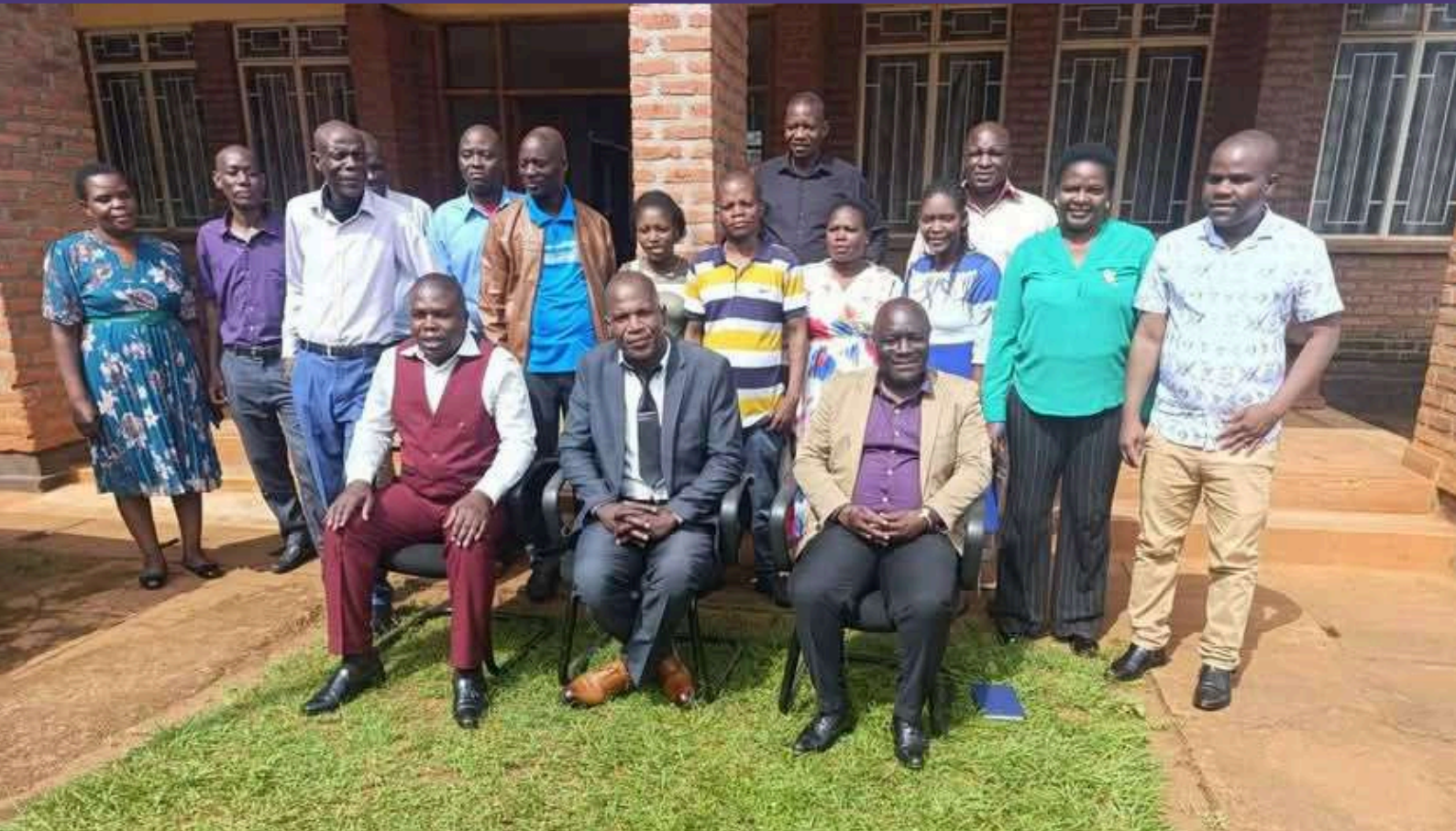
Insert: Participants posing for a group photo after the capacity building workshop in Mulanje district.

Police officers have been urged to prioritize professionalism when handling cases involving children and other marginalized groups to avoid infringing further harm.