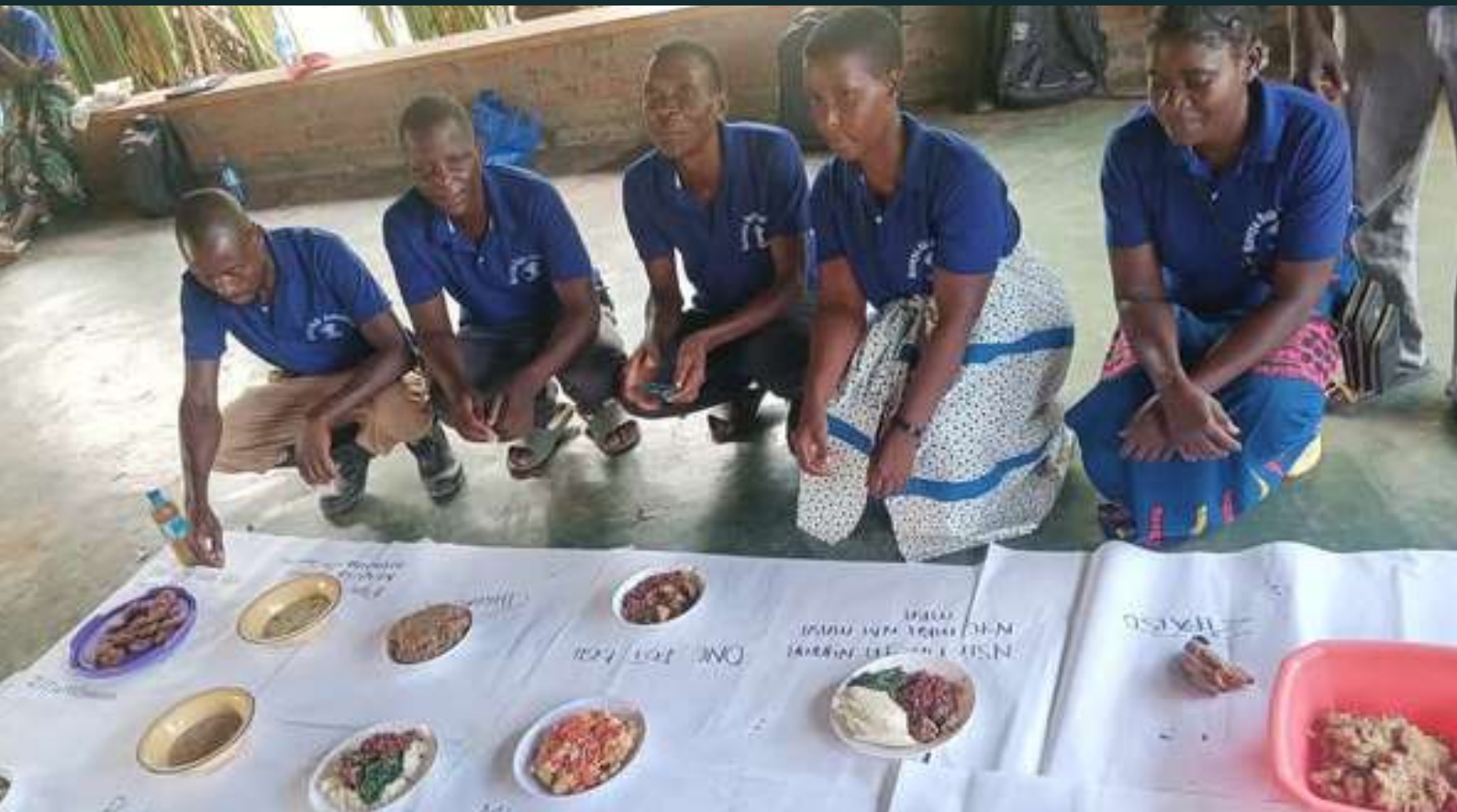
Insert: Community Based Trainers in Chikwawa demonstrating some of the healthier foods that they prepared during the cooking demonstration event.

YONECO, in partnership with the Chikwawa District Agriculture Office, conducted a cooking demonstrations for SLG members hands-on training session for facilitators in and ensuring that the knowledge gained in cooking demonstrations under the Social the sessions is being cascaded to the wider Protection for Gender Empowerment and community. Resilience (SP-GEAR) project.