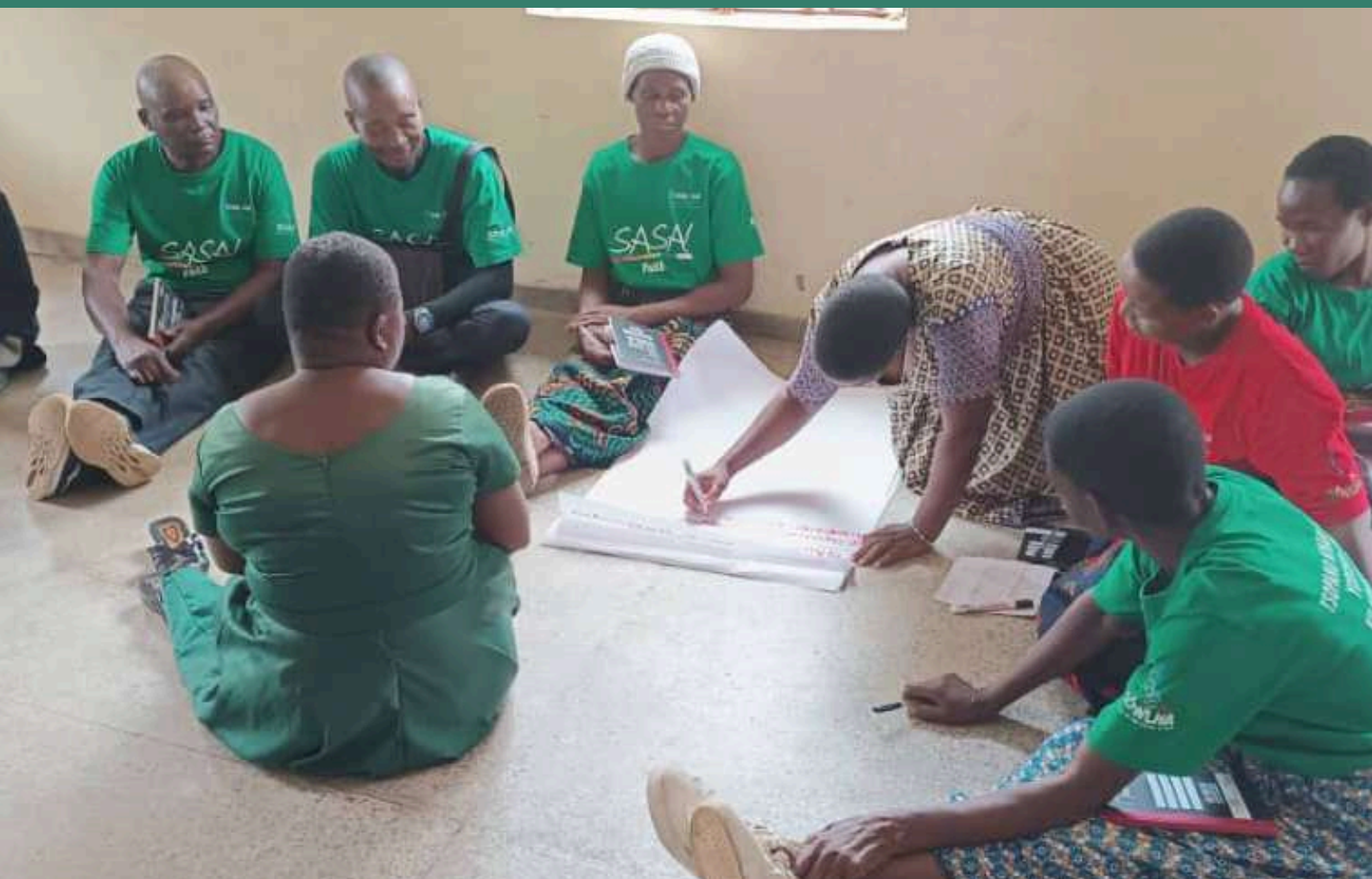
Insert: some members of Community Action Groups (CAGs) from Balaka during a breakout session at the training.

YONECO, with support from Trócaire and CAVWOC, has trained members of Community Action Groups (CAGs) and faith leaders from various areas in Balaka district on Gender-Based Violence (GBV) prevention and provision of Psychological First Aid (PFA) for Community from various areas around Balaka district.