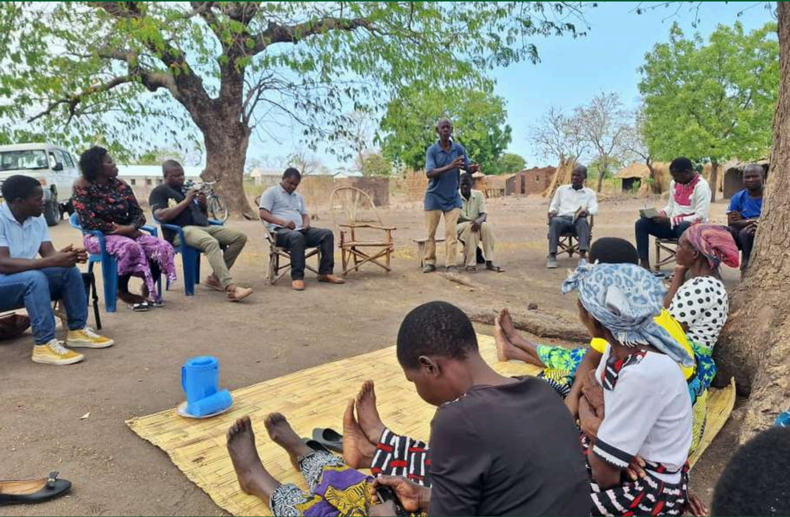
Insert: Chikwawa District Council officials together with other partners during one of the learning visits to SLGs under SP-GEAR project in the district.

YONECO, in collaboration with the Chikwawa District Council, organized a learning visit for Savings and Loan Group (SLG) members at Fodya Village in Traditional Authority (T/A) Ngabu's area.