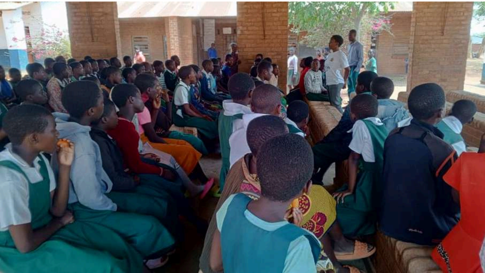
Insert: Learners at Chitipa Model School who were targeted during the life skills sessions in the district.

YONECO has been conducting life skills sessions at Chitipa Model Primary School with the aim of inspiring girls to stay in school and pursue their dreams.