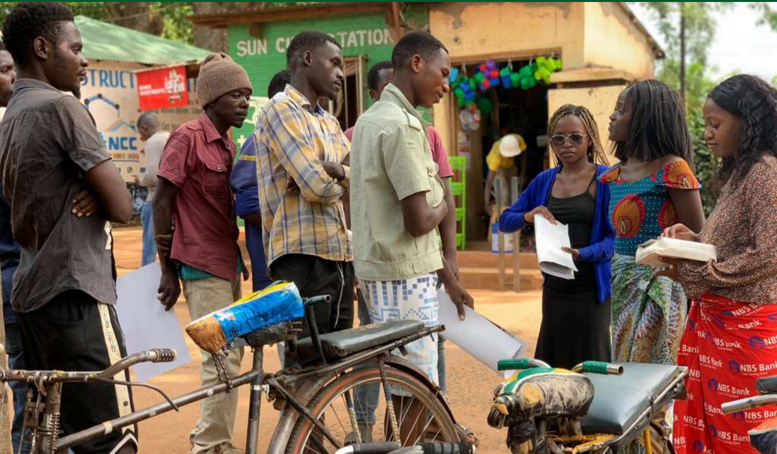
Insert: Field officers engaging some of the bicycle taxi operators in GBV prevention sessions in Mulanje district.

YONECO officers in Mulanje have conducted spot awareness sessions with Taxi Bicycle Operators (TBOs) around Mulanje Boma, focusing on the prevention of Gender-Based Violence (GBV).