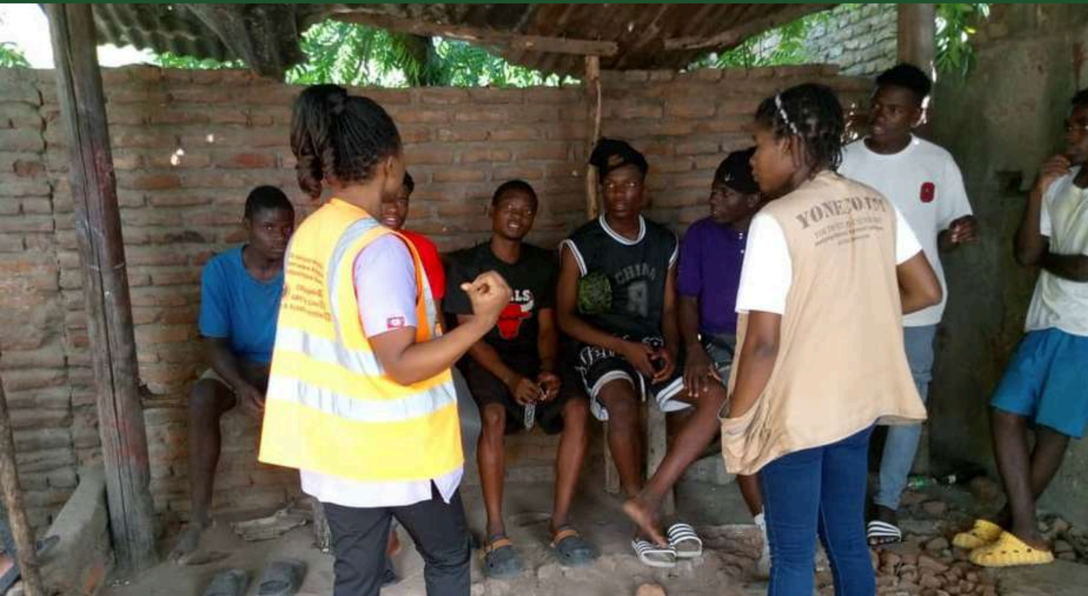
Insert: Field Officers captured here engaging some of the young people during the awareness in Mangochi district.

YONECO stepped up its community outreach efforts by engaging young people around Mwanyama Village in Traditional Authority (T/A) Mponda through health awareness sessions aimed at promoting responsible health practices.