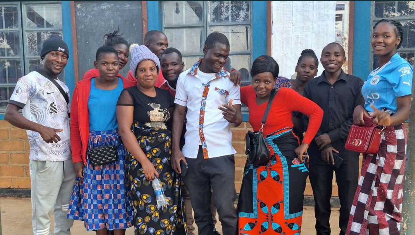
Insert: Some of the peer educators who took part in the digital skills training in Dedza district posing for a group photo.

YONECO has concluded an orientation session for Peer Educators in Dedza District, equipping them with digital skills to promote Sexual and Reproductive Health and Rights (SRHR) among young people in their communities.