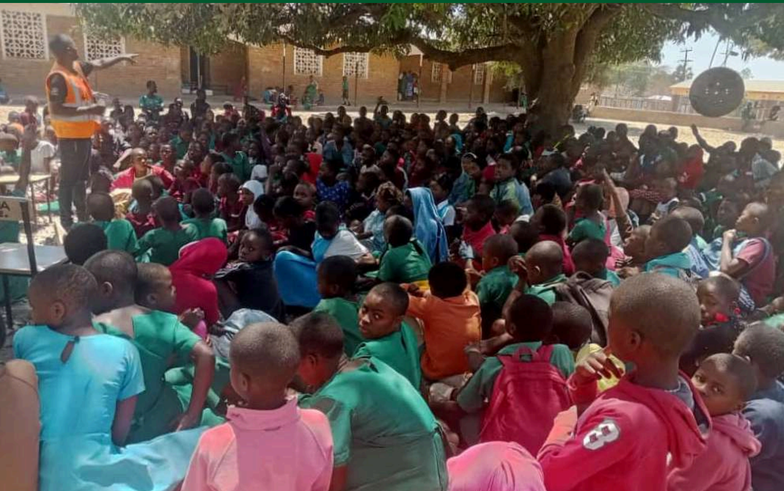
Insert: Learners at Mponda Primary School who were part of the suicide prevention session captured here.

On 2 October, 2025, YONECO conducted a suicide prevention session that was attended by about 600 learners from Mponda Primary School in Mponda village, under Traditional Authority (T/A) Nsamala.