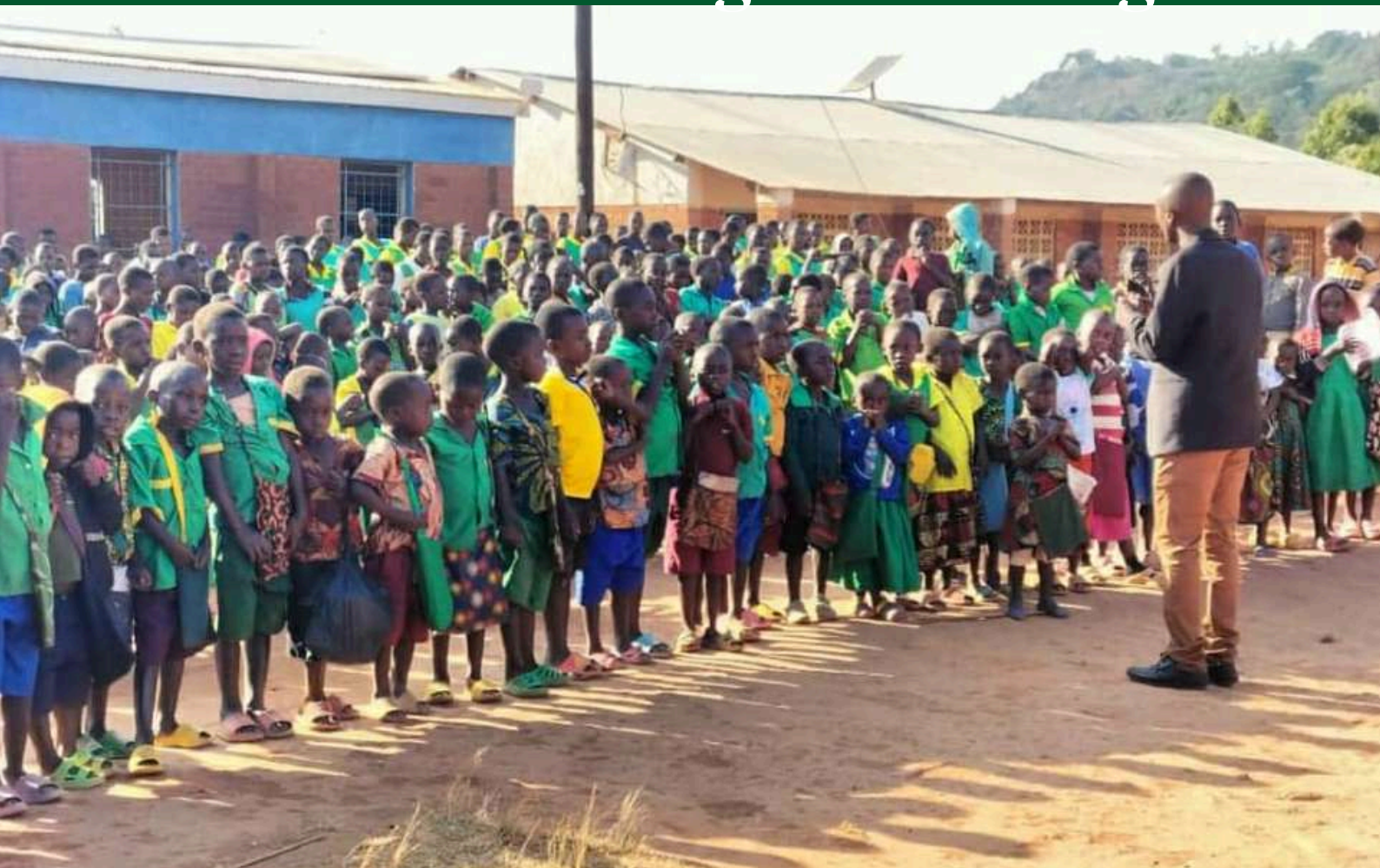
Insert: Some of the learners who are benefiting from the BEFIT program who were sensitized on effective use and care of the digital learning offered by the program.

YONECO and the Primary Education Advisor (PEA) for Kaseye Zone, equipped learners at Naching’amba Primary School in Chitipa with essential skills to make the most of their tablet-enabled learning sessions under Building Education Foundations through Innovation and Technology (BEFIT) programme.