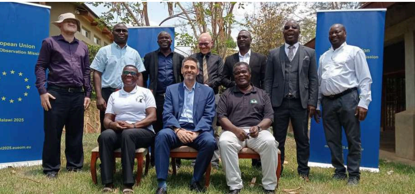
Insert: Representatives from various CSOs posing for a group photo together with the EU Ambassador to Malawi.

YONECO expressed its heartfelt appreciation to the European Union (EU) for its generous donation of assorted equipment to eight Civil Society Organisations (CSOs) in Malawi, including YONECO.