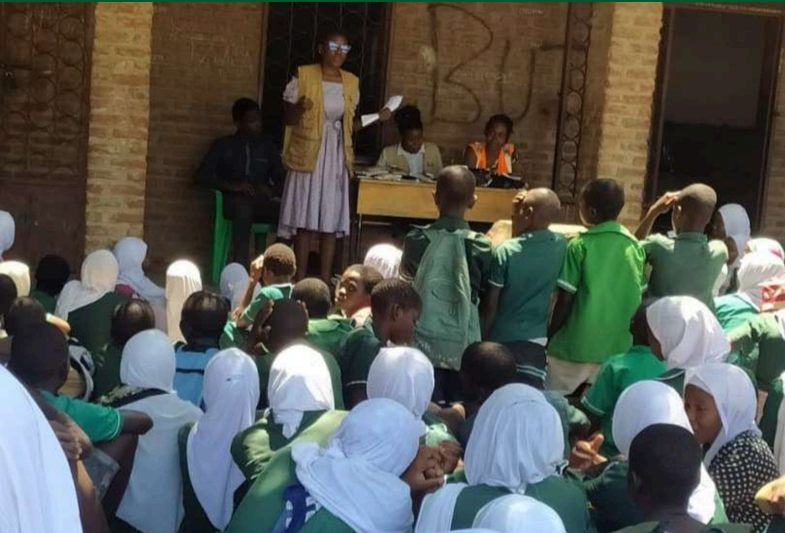
Insert: One of the field officers engaging with the learners who participated in the life skills session.

On 14 October 2025, a total of 157 learners from St. Augustine 2 Primary School in Mangochi participated in a life skills session organized by YONECO aimed at promoting positive behaviour among students.